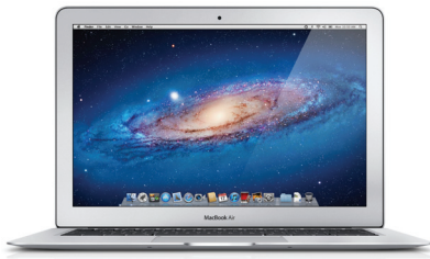
Model MC968, MC969