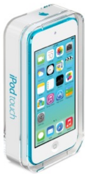
The retail packaging for iPod touch consumes 32 percent less volume, and is 38 percent lighter than the first-generation iPod touch packaging.