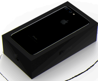
U.S. retail packaging of iPhone 7 Plus contains 86 percent less plastic than the previous-generation iPhone packaging and contains 60 percent recycled content.