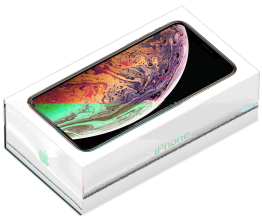
U.S. retail packaging of iPhone Xs Max contains 55 percent recycled content.