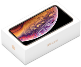
U.S. retail packaging of iPhone Xs contains 54 percent recycled content.