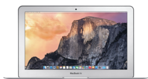
Models MJVM2, MJVP2 Date introduced March 9, 2015