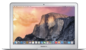
Models MJEV2, MJVG2 Date introduced March 9, 2015