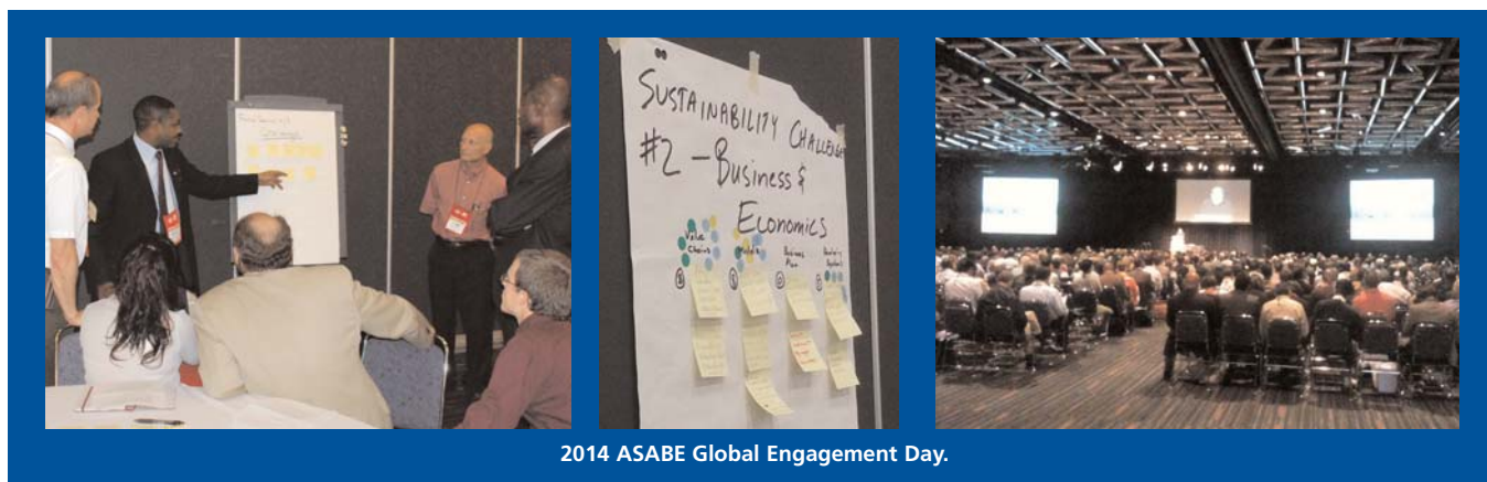
2014 ASABE Global Engagement Day.