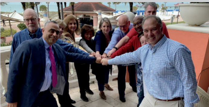
Group working on Strategic Plan.