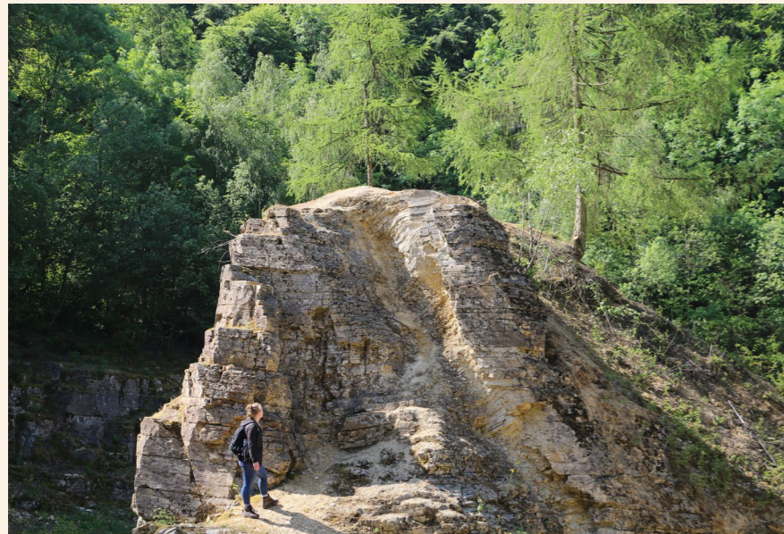
The "TERRA.track Hollager Berg" leads through the inactive Middelberg quarry at the Hollage Hill, which exposes calcitic limestones, dolomites and fossils indicating a sabkha environment during the Mid-Triassic age. Visitors get geologic information at the quarry via an information panel.