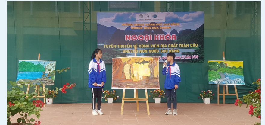
Members of Hoa Chung secondary school's "Geopark ambassador club" presented pictures of heritage sites in Non nuoc Cao Bang UGGp in an extracurricular session

With the objective to solve the problems in the geopark education in schools, the Management Board of Non nuoc Cao Bang UGGp has researched and studied some activities and methodologies related to geopark education in schools and advised Cao Bang Provincial People's Committee to mobilize "Geopark ambassador club" for the evolution of the geopark education activity. This activity aimed at developing a group of students (with a passion for exploring culture, history,