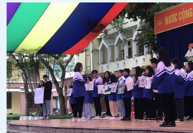
Communication activities organized by "Geopark ambassador club" members at Cao Bang High school for gifted students and Cao Bang city high school

model, Non nuoc Cao Bang Management Board in collaboration with Cao Bang Department of Education and Training studied and developed 2 documents: the Operational guiding document and the framework document for the implementation of the "Geopark ambassador club" model. After finalizing these 2 documents, the Management Board of Non nuoc Cao Bang UGGp cooperated with Cao Bang Department