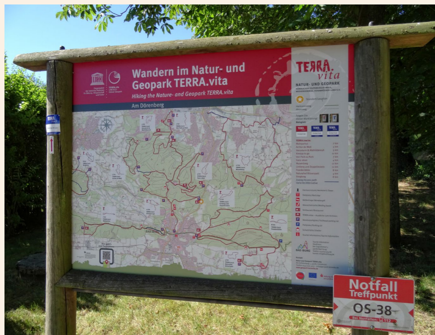
Map panels in two languages give hikers an overview of local tracks at parking sites for hikers and close to bus stops.