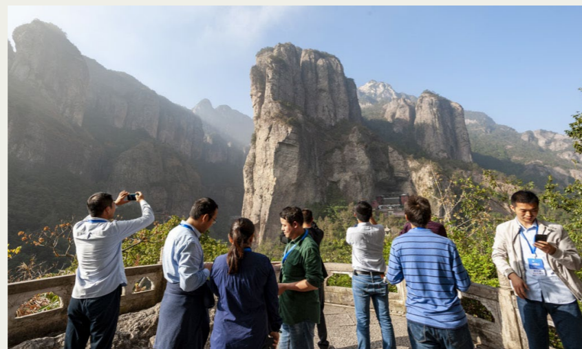
◆ Field excursion

During the forum, Hexigten Global Geopark submitted a