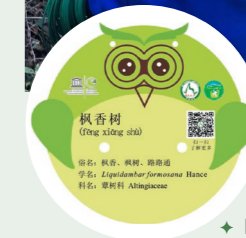
◆ Installing the Explanatory Board