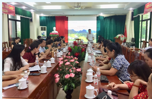
Training of trainers (ToT) workshop for teachers involved in “Geopark ambassador club” of the piloted schools

activity. The implementation of the model is also convenient thanks to the operational guiding document, training courses on the club model implementation for teachers and students. It is the students who decide the forms and contents of geopark education propaganda activities. Through such activities, it is easy for other students to acquire information about the geopark, because the language used in communication activities is expressed through club members who are students of the same age and background knowledge as them; the propaganda activities are also more attractive to students because these activities are organized by the students. Especially, the students participating in the club have a chance to develop more skills like communication skills: taking pictures, reporting news, making propaganda clips,