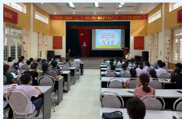
Training course on the geopark for “Geopark ambassador club” members prior to field experiencing at heritage sites