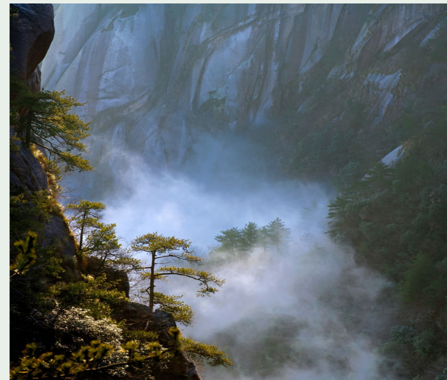
◆ Pinus taiwanensis Group