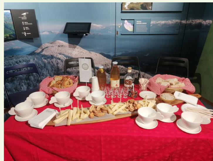
◆ Idrija Selected tasting