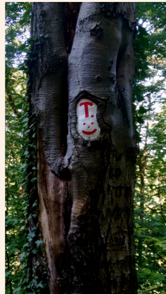
Make hikers smiling – The "T" denotes the TERRA. tracks on trees. The paint is environmentally friendly.