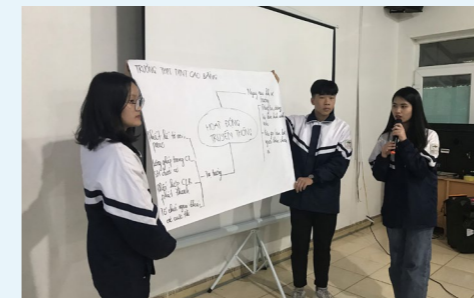
Members of “Geopark ambassador club” of Cao Bang high school for gifted students and Cao Bang Ethnic minority boarding school practiced planning activities on geopark communication in schools