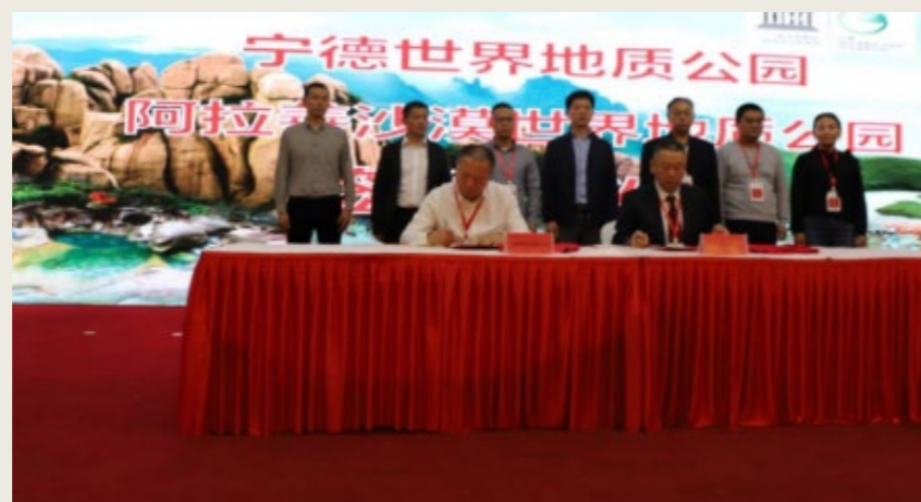
◆ Ningde UGGp tied a sister geopark relationship with Alxa Desert UGGp