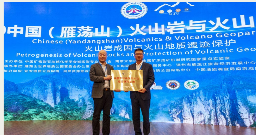
◆ Plaque presentation of “East China Mesozoic Volcanic Geological Research Centre” to Yandangshan Global Geopark