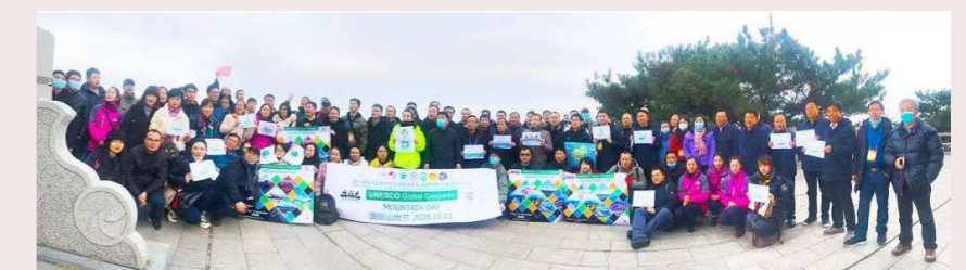
◆ Participants celebrating International Mountain Day in the Geopark

It is very encouraging that several UGGps expressed their willingness to co-host the next training courses in their Geoparks. After friendly discussion, a decision was made that the 7th International Training Course on UGGps Management and Development will be held in Zhangye UGGp in the last week of October, 2021.