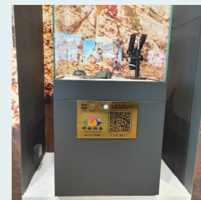
◆ The fossil specimens installed with intelligent guide panel

Geopark Administration of Xiangxi Autonomous Prefecture, China xxzsxdzgy@163.com