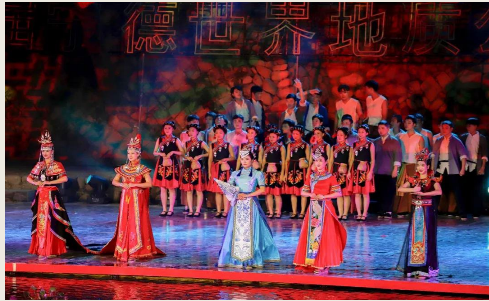
◆ Displaying of intangible cultural heritage of folk custom