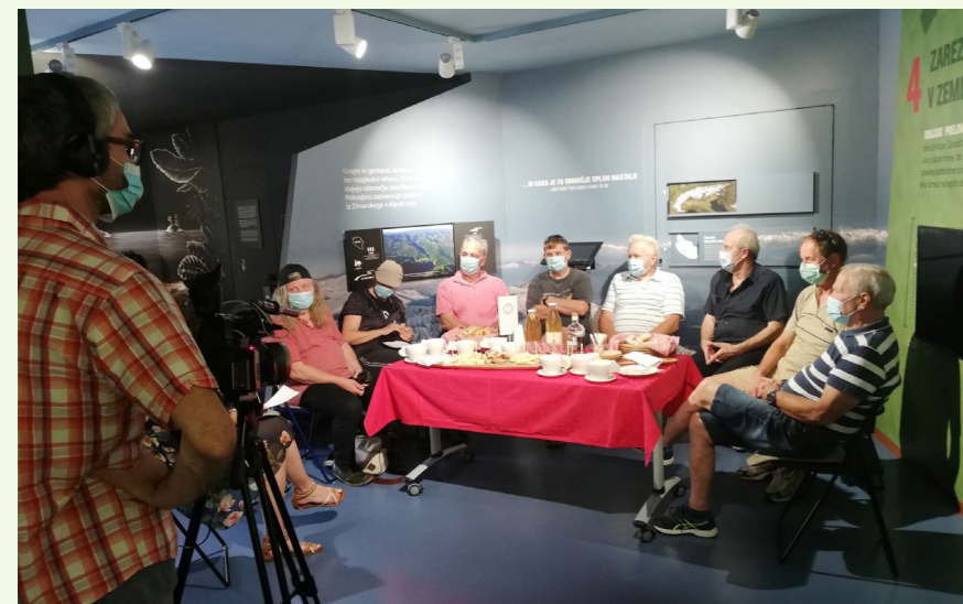
◆ A round table at the Visitor Centre

organized catering events of local culinary products that carry the Idrija Selected trademark quality certificate. The tastings were organized as part of the tourist programmes, educational events, seminars or as individual events. We pilot tested several new tourist programmes in 2020, where visiting the Idrija Geopark Visitor centre exhibition was one of the main activities,