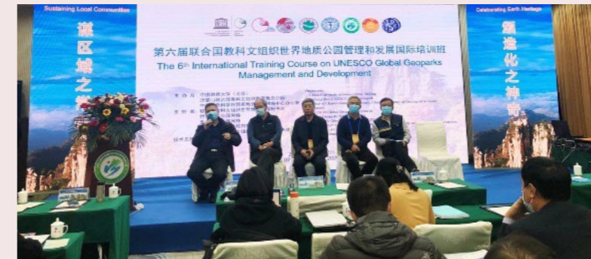
◆ Presentations and panel discussion

inspection and exchange, Geopark challenges and opportunities, Brand building and promotion, case studies.