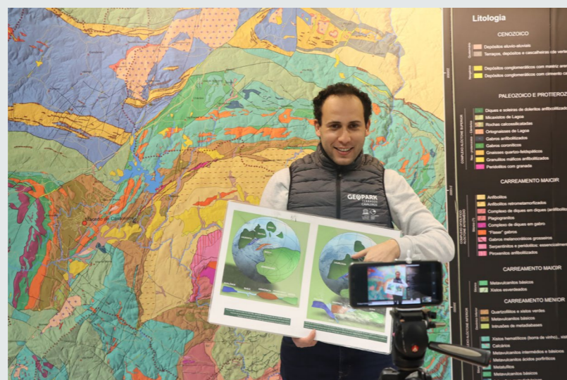
Geo Education and Science Poularization Terras de Cavaleiros UGGp Portugal

Terras de Cavaleiros UGGp geral@geoparkterrasdecavaleiros.com