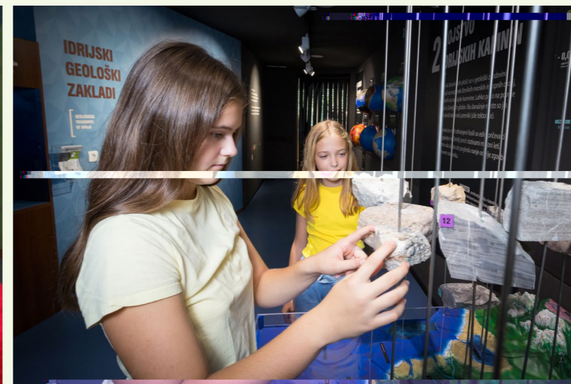
◆ Children exploring the geological exhibition