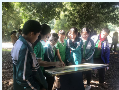
Members of "Geopark ambassador clubs" of piloted secondary schools at Nguom Slua Geosite and Pac Bo national special monument.

development process of Non nuoc Cao Bang UGGp, tangible and intangible heritages, geological and geomorphologic heritages, etc. Moreover, students have learnt about Non nuoc Cao Bang UGGp in Local History and Geography lessons under the form of integrated learning. It is the fact that the geopark education in schools in the period 2017-2019 has achieved certain results, especially, in the promotion of the UNESCO Global Geopark label to school students