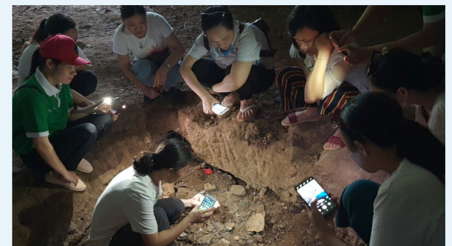
The core teachers in charge of “Geopark ambassador clubs” joined field experience survey trips to Nguom Boc geosite and Ban Gioc waterfall as a part of the Training of trainers organized by the Geopark.