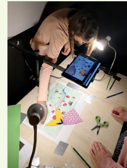
◆ Stop motion animation workshop for children

Our Visitor centre is also a great place for children's workshops. During the European heritage days in September 2020, we successfully hosted an animation workshop for children, which took place in the exhibition area of the centre. Children became acquainted with the geological history of Idrija and created a "stop-motion" animated video about the Idrija fault and earthquakes in this area. The workshop was a great success and our youngest visitors were very curious about everything at the Visitor centre exhibition. In this way, geological knowledge is passed down in an indirect and unobtrusive way, children are taught through the use of workshops and also the Visitor centre themes at the same time,