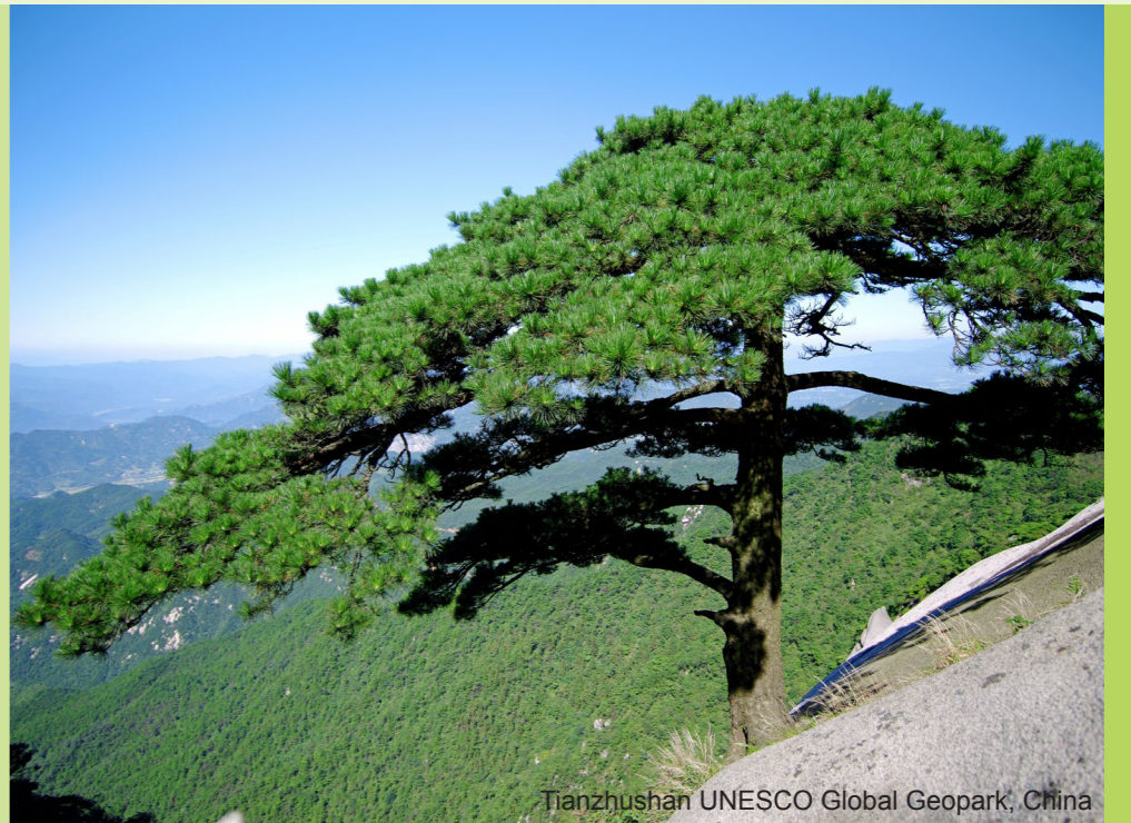
Tianzhushan UNESCO Global Geopark, China