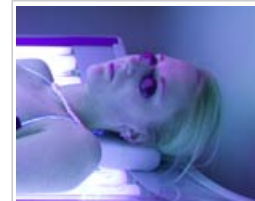
Sunbed users should wear eye protection