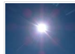
UV radiation from sunbeds and from the sun is essentially the same

3.1 Natural and artificial sources of UV radiation have similar short-term effects on health, but, due to the scarcity of the data available, it is very difficult to compare their long-term effects.