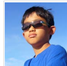
UV radiation can harm the eyes

In the long term, exposure to UV radiation can cause skin cancers and premature ageing of the skin. The risk of developing skin cancers depends on the amount and pattern of sun exposure, and on skin type. For the most lethal type of skin cancer, the risk also depends on age, physical characteristics such as fair hair or the presence of moles and freckles, as well as family history of skin cancer.