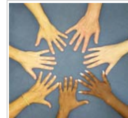
The risk of skin cancer depends on skin type

2.1 Exposure to sunlight has some beneficial effects. It is responsible for the production of vitamin D in the body, which is essential for maintaining healthy muscles and bones and may also have other health benefits. However, eating foods rich in vitamin D or taking adequate levels of vitamin D supplements is likely to produce the same beneficial effects.