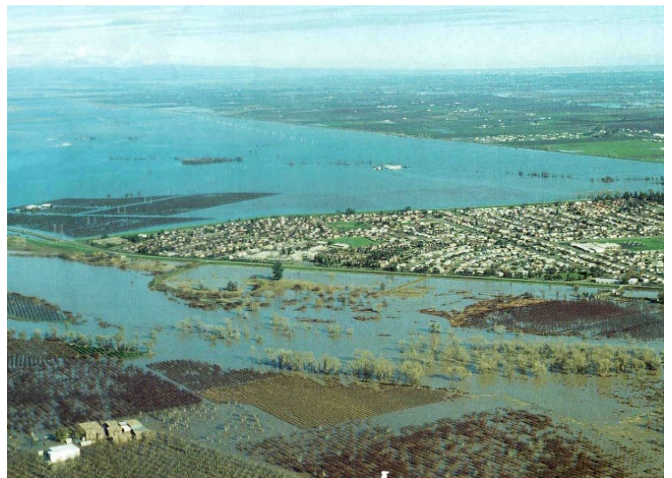
Image: An aerial view of widespread flooding in Yuba and Sutter counties in 1997 after heavy rain from an atmospheric river.

The Yuba-Feather FIRO program and the alignment of this effort with Water Control Manual updates has been largely driven by local and state agencies. Continued state and federal investments in atmospheric river research, FIRO and Water Control Manual updates are crucial to expanding this approach to other parts of the western U.S. to address climate change and its impacts on people and the environment. For the latest status and additional information on this work, visit https://cw3e.ucsd.edu/firo .