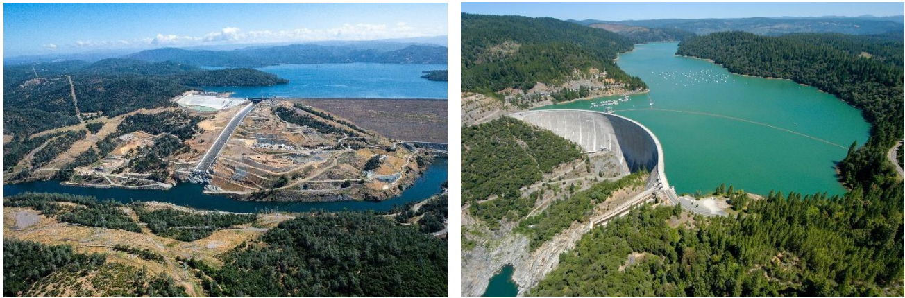
Figure E-2. Lake Oroville (left) and New Bullards Bar (right) in the Yuba-Feather watersheds