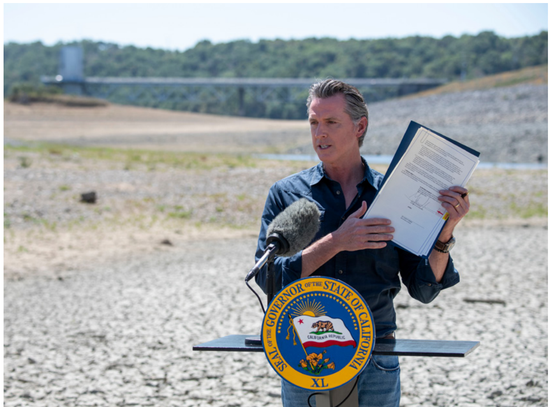
California governor Gavin Newsom holds a news conference in the parched bottom of Lake Mendocino, announcing his drought-emergency proclamation for Mendocino and Sonoma Counties, April 21, 2021.

extra water was released from the reservoir as soon as safely possible after the storm, as required by the