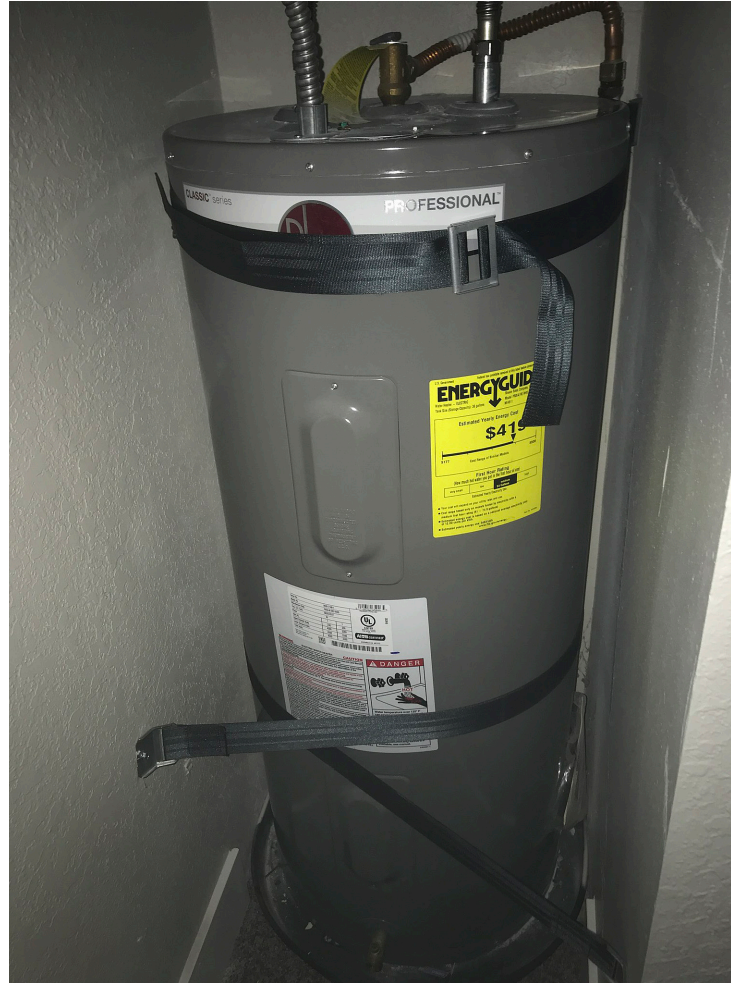
Turning down the temperature on your water heater not only reduces the risk of scalding, it can also save money.

If you have a dishwasher without a booster heater, it may require a water temperature within a range of 130°F to 140°F for optimum cleaning. And while there is a very slight risk of promoting legionellae bacteria when hot water tanks are maintained at 120°F, this level is still considered safe for a majority of the population. If you have a suppressed immune system or chronic respiratory disease, you may consider keeping your hot water tank at 140°F. However, this high temperature significantly increases the risk of scalding. To minimize this risk, you can install mixing valves or other temperature-regulating devices on any taps used for washing or bathing.