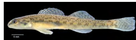
Johnny Darter Etheostoma nigrum Max size: 40 mm