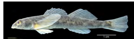
Glassy Darter Etheostoma vitreum Max size: 55 mm