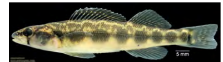
Stripeback Darter Percina notogramma Max size: 70 mm