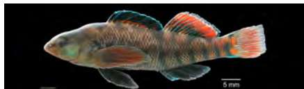
Rainbow Darter Etheostoma caeruleum Max size: 50 mm