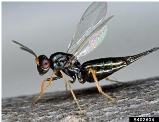
T. planipennisi . David Cappaert, Michigan State University, Bugwood.org

While most trees can tolerate low to moderate levels of boring insects, the density of EAB infestations overwhelms our ash trees. Biocontrols have the potential to reduce EAB populations and allow ash trees to survive. This will reduce the need to treat or remove our trees over time, and protect the ecological benefits that our ash trees provide.