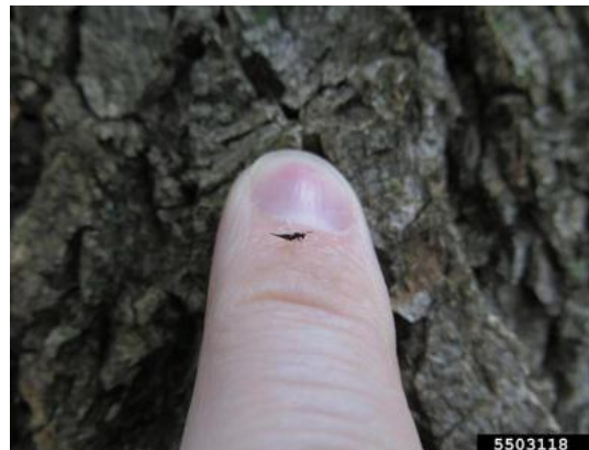
T. planipennisi.