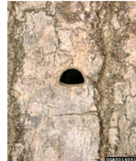
D-shaped exit holes