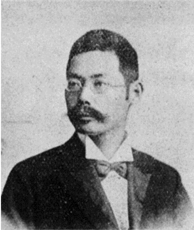
Professor Fusakichi Omori

With a short note, we would like to draw the attention of the scientific community to the jubilee of the outstanding Japanese seismologist Fusakichi Omori. He was born 150 years ago, on October 30, 1868, received a brilliant education at the Imperial University of Tokyo, and made a discovery at the age of 26 widely known as Omori's law. The Omori law states that after a strong earthquake, the frequency of aftershocks n , i.e., the repeated shocks that follow the main shock, decay with time t , on average, according to the hyperbolic law