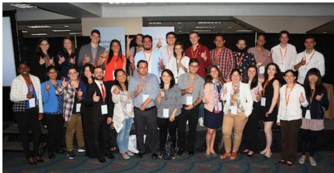
Fig. 1. Photo of most SSA and LACSC Travel Grant recipients

acknowledgement of the IASPEI and IUGG support as well as the SSA donation fund. Fig. 1 shows a picture of most LACSC and SSA travel grant recipients.