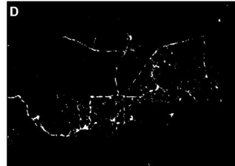
Images of a logged area from a January 2019 PlanetScope image of the Subim forest reserve in Ghana. A) True color image, B) False color-infrared image, C) Normalized difference red-green index (NDRGI), with lighter tones indicating higher values, D) thresholded NDRGI index, with white areas indicating logging disturbance.