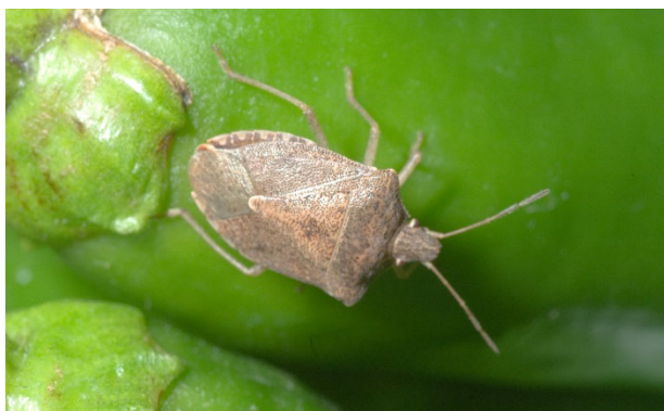
Figure 4. Brown stink bug on pepper fruit.

There are several species of stink bugs which damage peppers including brown, green, and brown marmorated stink bugs. Stink bug feed with piercing-sucking mouthparts and inject digestive enzymes into the pepper fruit while feedings. This results in a type of damage called ‘cloud spots’ to the fruit. These are light-colored corky areas under the skin.