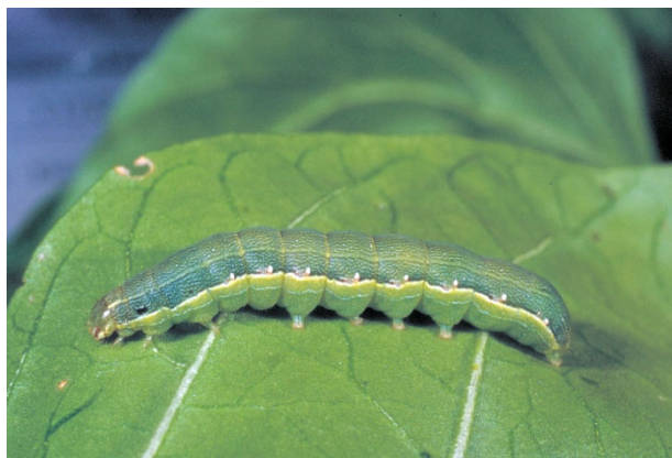
Figure 2. Beet armyworm is an occasional pest in Kentucky.

The beet armyworm is a major pest in the southwestern and southern US attacking alfalfa, beans, beets, cole crops, corn, lettuce, onion, peppers, potatoes, peas, and tomatoes. It is an occasional invader of vegetable crops in the Ohio River Valley. Although it cannot overwinter in Kentucky USA, it is a significant pest for vegetable growers because of its wide host range and resistance to most insecticides. This insect is killed by the first hard frosts in the fall. Producers of fall vegetable crops need to watch out for this pest during August and September.