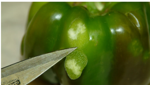
Figure 5. Stink bug damage occurs below the skin of the fruit.

Stink bugs are highly mobile and readily move from crop to crop as the season progresses. Growers should monitor for stink bugs weekly and treat as needed.