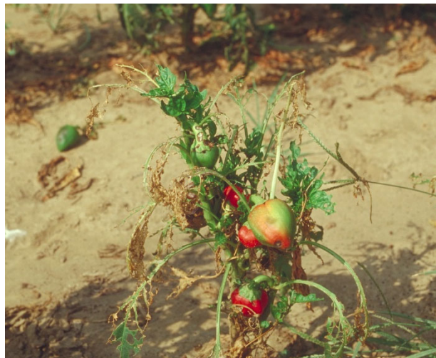
Figure 3. Beet armyworm damage can be severe.

one larvae may attack several plants in a row. Older larvae may feed on fruit as well as leaves. After they complete their feeding, the 1-1/4 inch larvae pupate in the soil in a loose cocoon containing soil particles and leaf fragments. The life cycle takes about a month to complete.