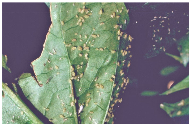
Figure 6. Green peach aphids can be common following pyrethroid applications.

Several aphid species may be commonly found infesting peppers during most of the growing season. The most common aphid on peppers is the green peach aphid. Large numbers of aphids can affect pepper production in two ways. Honeydew produced by aphids can leave a sticky film on the surface of the fruit and cause the development of sooty mold fungi. Various species of aphids can also transmit viruses, notably potato virus Y, that can reduce yields. Aphid infestations may begin in the greenhouse on pepper transplants.