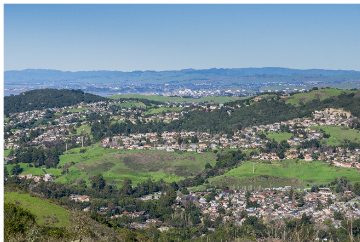
Zoning can be used to target development in specific areas and preserve natural areas.

Zoning techniques include watershed-based zoning, overlay zoning, floating zones, incentive zoning, performance zoning, urban growth boundaries, large lot zoning, infill/community redevelopment, transfer of development rights (TDRs) and limiting infrastructure extensions. Table 1 describes each of these techniques and discusses how they can be useful.