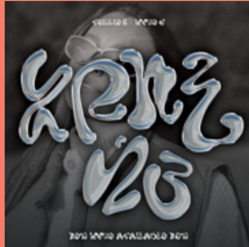
Gloop by Abbey Purcel