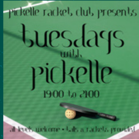
Pickelle by Chloe Day