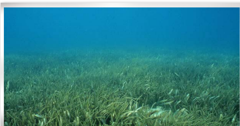
Grassbed with turtle grass (wide blade) and manatee grass.

Protection Agency and the state of Florida, was established to protect the coral reef from impacts due to nutrient pollution. Since its inception, the program has supported critical ecosystem monitoring and research projects designed to help sanctuary managers make informed decisions about resource issues.