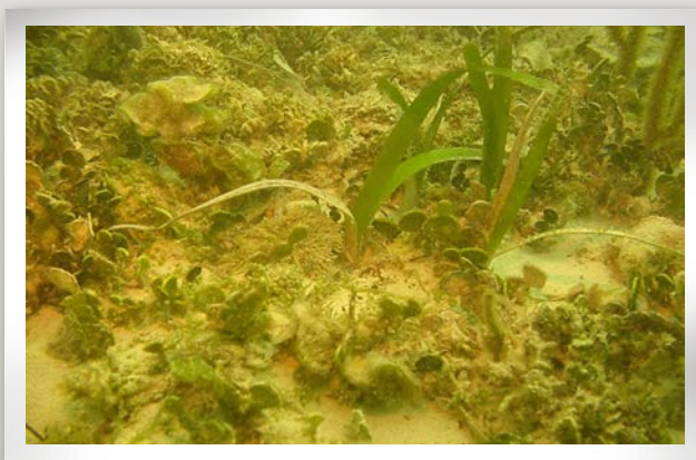
Green macroalgae growing near turtle grass shoots.

seagrass-dependent species are likely to disappear due to lack of habitat. Instead, animals that feed and live in the water column as part of the microalgae-based food web will predominate. This shift from a seagrass-based food web to one that is water column-based represents a significant change in the area's ecology and can negatively affect recreational and commercial fisheries, which depend upon seagrass meadows as nurseries and feeding grounds.