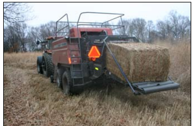
Figure 12 Delaying harvest of switchgrass until after frost improves feedstock quality.