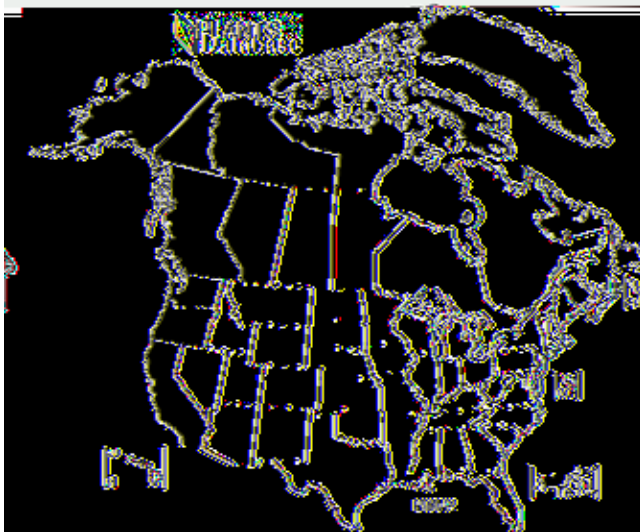
Figure 1 Switchgrass area of occurrence