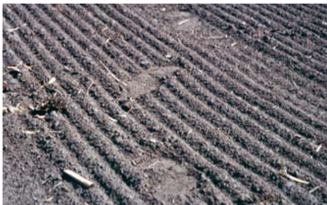
USDA NRCS Bismarck, ND