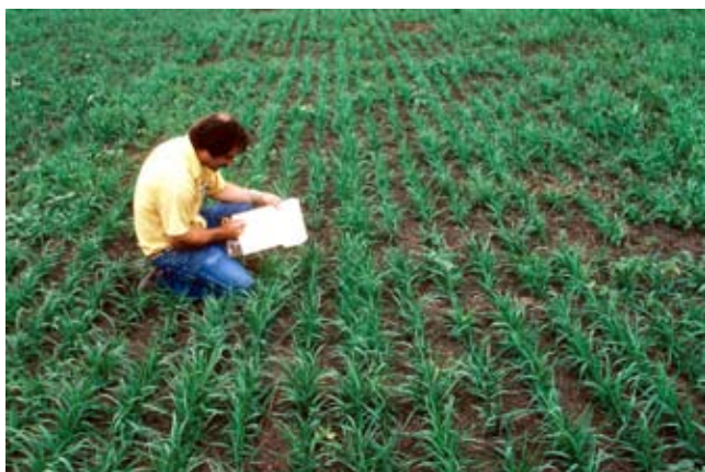
USDA NRCS Bismarck, ND