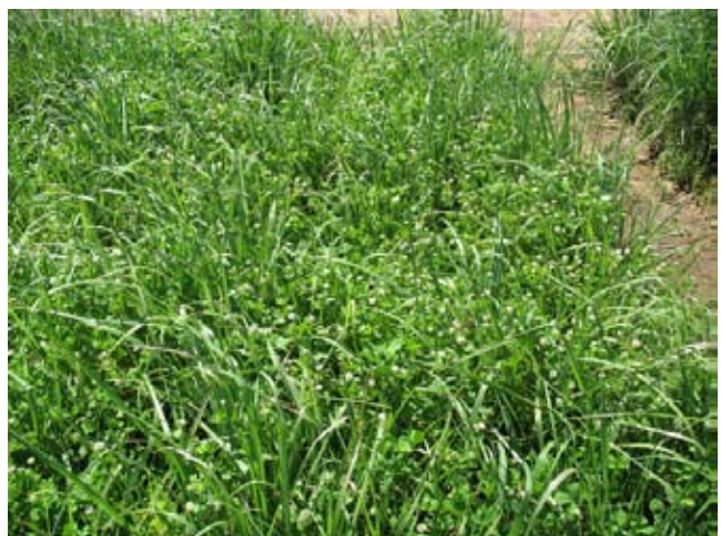
USDA NRCS Nacogdoches, TX