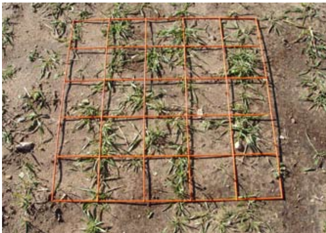
Figure 10 Frequency grid used to assess stand success of switchgrass

Traditional row crop agriculture is generally depicted as uniform fields of a single crop such as corn ( Zea mays ) growing on level to gentle rolling fields that are weed free. However, switchgrass grown for biomass may not necessarily portray this type of agriculture. Weeds can be common the first few years in switchgrass fields. Do not assume that the planting is a failure if weeds are present in the field and the switchgrass plant population appears sparse. As the switchgrass plants produce tillers and plants increase