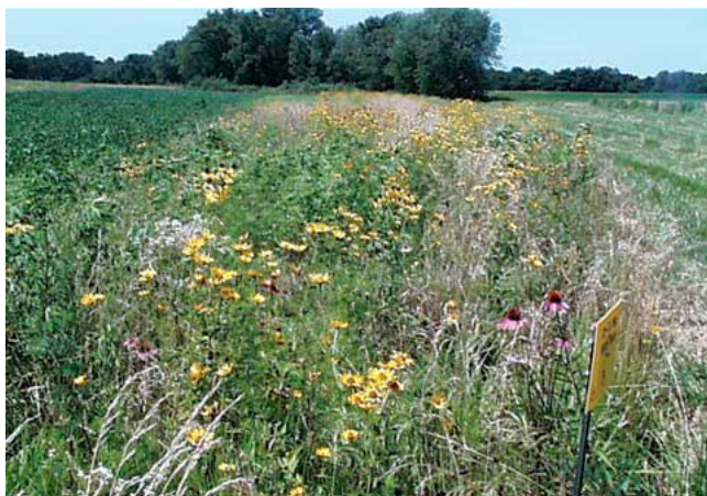
USDA NRCS Elsberry, MO