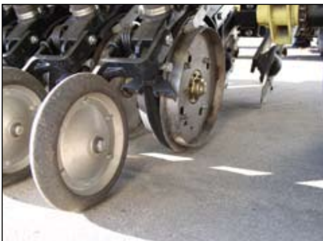
USDA NRCS Bismarck, ND