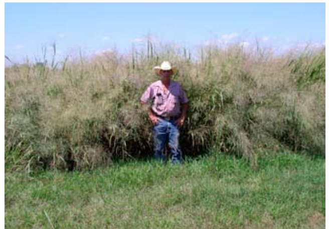
Figure 11 Switchgrass reaches full production 3 years after planting