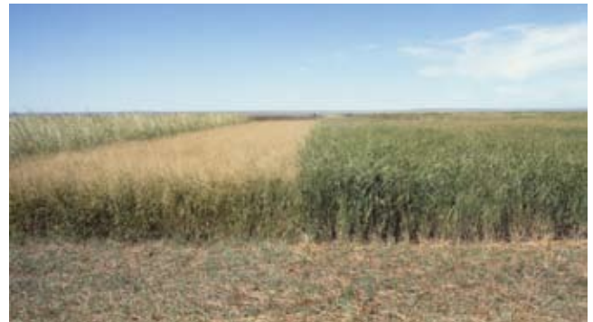
USDA NRCS Bismarck, ND