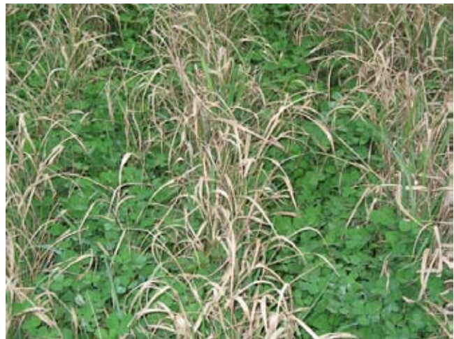
Figure 9 Ball clover interseeded into Alamo switchgrass at the USDA NRCS East Texas Plant Materials Center near Nacogdoches, TX, (early spring growth of Alamo and ball clover (top)/late spring growth of Alamo and ball clover (bottom))