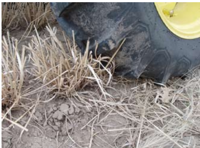
USDA NRCS Manhattan, KS

A traditional, sidebar-type sickle mower can be used to cut switchgrass the first and possibly the second year harvest after establishment. However, in subsequent years as the switchgrass plants reach full maturity, that type of mower will not be able to cut the switchgrass, especially when making a single harvest in late fall due to the large diameter of the stems and the inability of the sickle to maintain a consistent cutting height of 6 inches. A disc-type mower becomes more effective, but may also present a challenge as the height of the switchgrass may reach 6 to 8 feet by late July in the Southeast and by the fall in many regions of the United States. Mowers equipped with swinging flail blades may have more merit than a disc-type mower for cutting mature switchgrass. Crushing or conditioning the biomass prior to baling is not recommended.