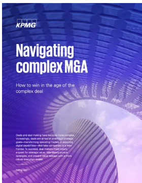
Navigating complex M&A