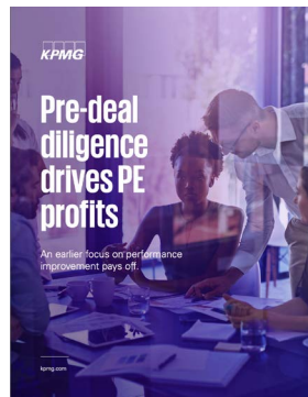
Pre-deal diligence drives PE profits