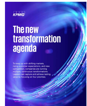
The new transformation agenda