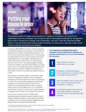
Putting your house in order