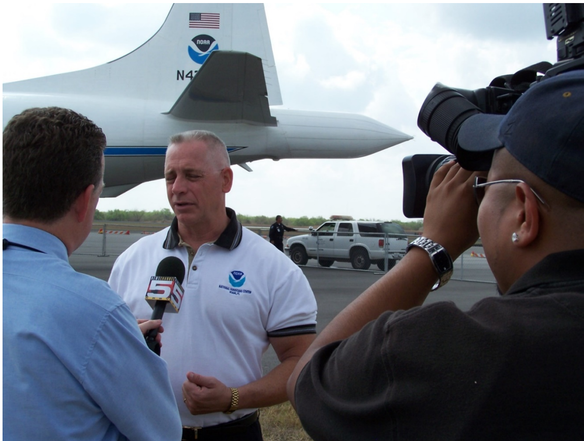
Stacy Stewart provides an interview regarding hurricane preparation to KRGV-TV5 in Brownsville, Texas during the first stop of the NOAA Hurricane Awareness Tour in April 2006.