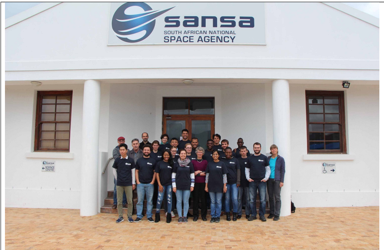
The 3 rd IAGA school (Hermanus, South Africa)

The third IAGA Summer School took place at SANSA Space Science in Hermanus, South Africa, from 20-26 August 2017 (the week before Scientific Assembly of IAPSO-IAMAS-IAGA). The event was attended by 19 post-graduate students from 15 countries worldwide (e.g., Algeria, Brazil, Mexico, India, Japan, Russia, Poland, UK, South Africa). The attendees included students nominated for the IAGA Young Researcher Award, or nominated by the IAGA Division and Working Group leaders. Altogether 6 topics across all the disciplines of IAGA were covered by lectures given by experts in their fields. Lectures were accompanied by practical projects that the students worked on in groups and presented on the last afternoon. Interactions among students and between students and lecturers were very friendly and informal and friendships and networks were formed. Both the students and the lecturers gave very positive feedback on the event.