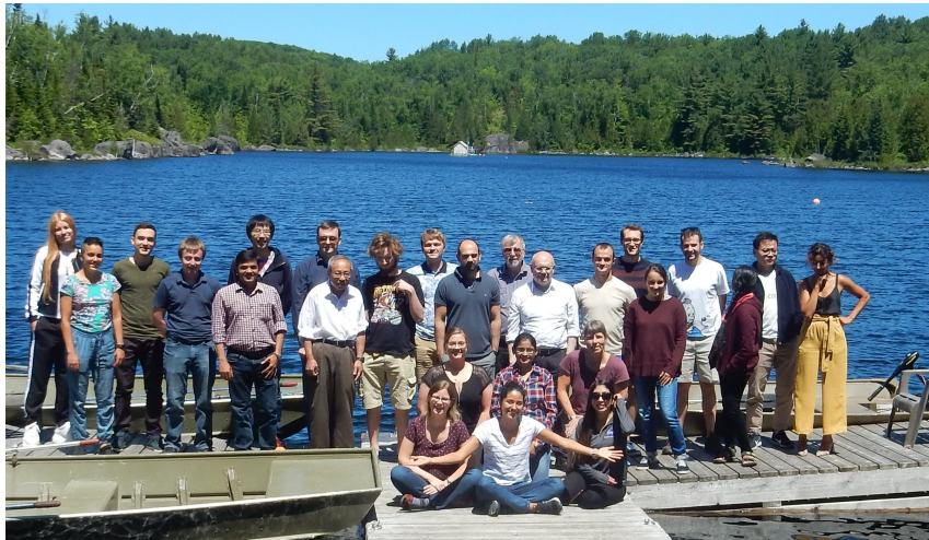
Figure 2: Group photo taken at the 4 th IAGA School

The 4 th IAGA School, prior to the IUGG General Assembly in Montréal, Canada, was held at the Station de biologie des Laurentides (SBL), ca. 80 km NW of Montreal. The School was attended by 20 students, with 5 from Europe (France, Germany, Poland), 3 from Russia, 5 from Asia (India, Japan, China), 6 from North America (USA, Mexico, Canada) and 1 from South America (Brazil). Topics across all the disciplines of IAGA were covered by lectures given by experts in their fields, and both the students and the lecturers gave very positive feedback on the event.