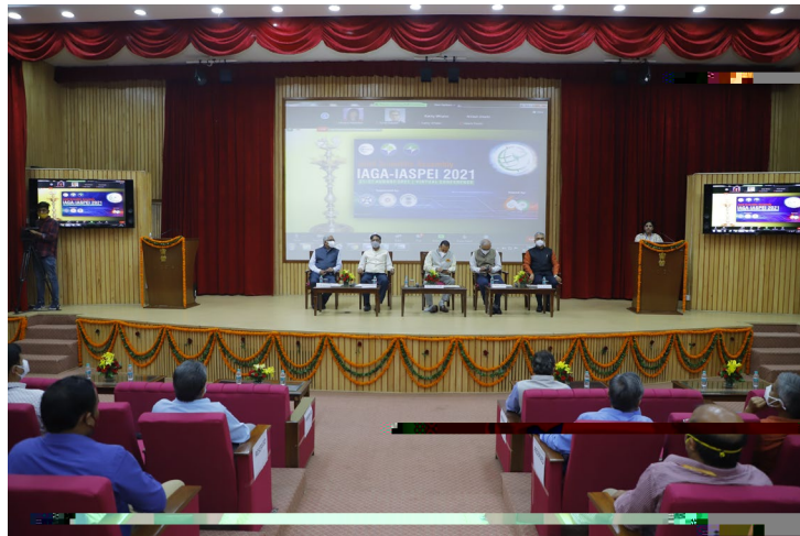
The opening ceremony of the IAGA-IASPEI Joint Assembly 2021 was attended in person by selected local participants and streamed online for all others.