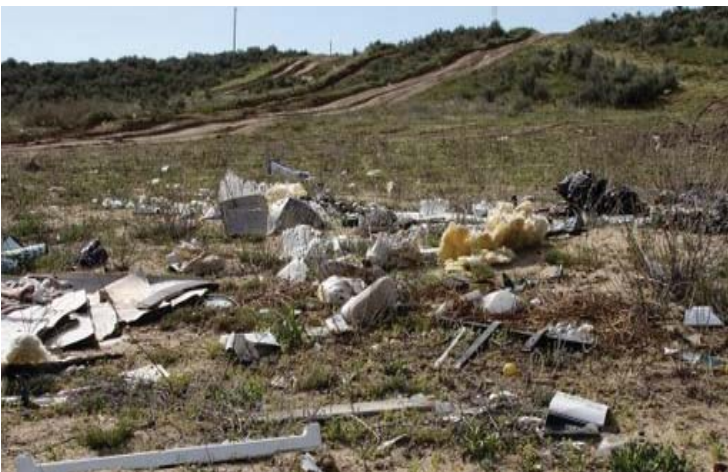
One of many piles of trash dumped at the reservoir; photo by Jane Rohling.

Contact Sean Finn at: a_gentilis@hotmail.com if you would like to participate in the next clean-up!