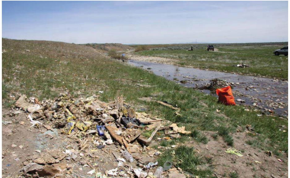
Jewel of the Desert? Dumping of trash hurts this important bird area; photo by Jane Rohling.

The long-term goal of seeing the site become functioning bird habitat and a regional wildlife viewing area is being achieved through a multi-pronged strategy of on-the-ground conservation, fund-raising, and cooperative planning. Clean-up efforts were reinitiated on April 24th and 25th when an Ada County Sheriff's SILD crew was followed by a volunteer clean-up effort in association with Earth Day. Over 60 volunteers