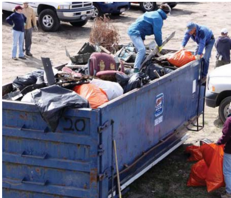
A dumpster that was quickly filled up; photo by Jane Rohling.