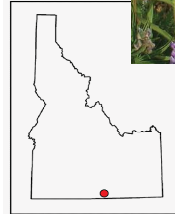
The only location where Christ's Indian Paintbrush can be found; map: IDFG.