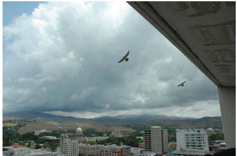
The parents were never far from the nest

The idea of using a webcam inside the peregrines' nest box had been discussed by various individuals for several years. From the outset, there were logistical problems to solve, financial limitations, and