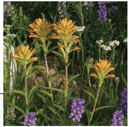
Christ's Indian Paintbrush

Conservation and Management: this rare population is managed by the Sawtooth National Forest, Minidoka Ranger District. It is currently ranked as one of Idaho's rarest plant taxa.