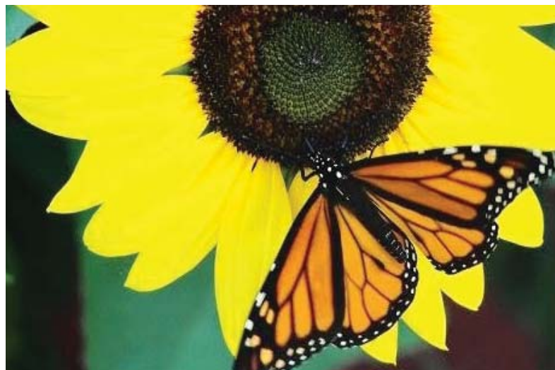
Adult butterflies searching for nectar are attracted to brightly colored plants; © Sandra Vistine-Amdor.