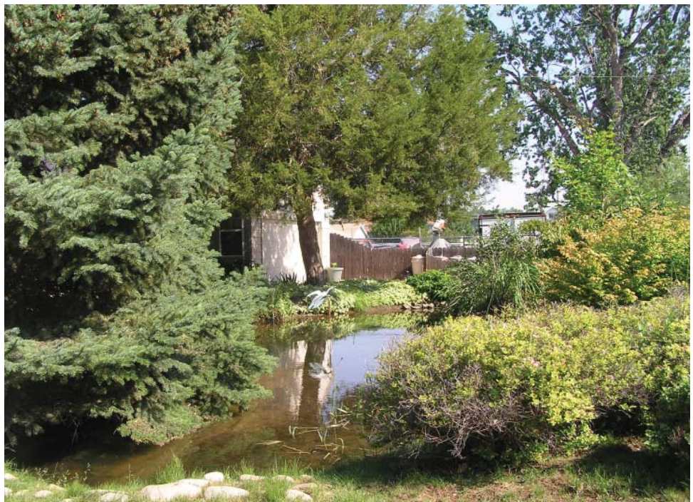
A backyard wildlife haven; © Sara Focht.

Learn about bird houses, bird feeders, butterfly gardens, water features, native plants, managing weeds, reptiles and amphibians and much...much...more!