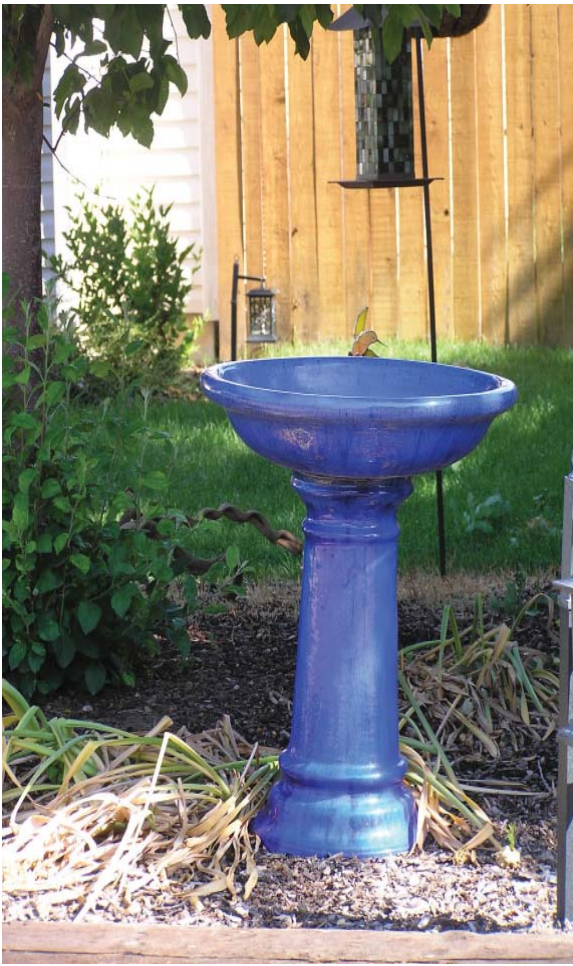
A bird bath is an easy addition to your backyard habitat; © Sara Focht.

such as antelope bitterbrush, golden currant or some of the sagebrush varieties can provide protection from predators and excellent thermal cover during colder months. Ground cover of ferns, flowers and grasses along with lawn clippings or wood chip mulches offer cover to ground-dwelling small mammals, reptiles and amphibians. Non-living vegetation in the form of brush piles and snags (dead or dying trees) is used as cover, as well as roosting and nesting sites. If you do not have any backyard snags, you may want to construct nest boxes. These should be built for specific wildlife species.