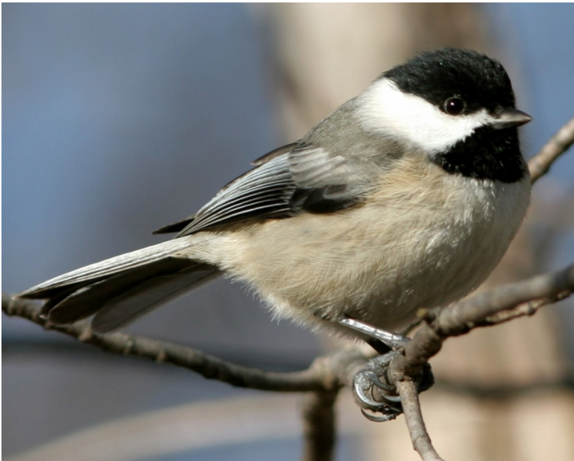
Black-capped chickadee

(National Wildlife Federation article adapted from “Perilous Journeys” by Steve Kemper, National Wildlife , October/November 2008)