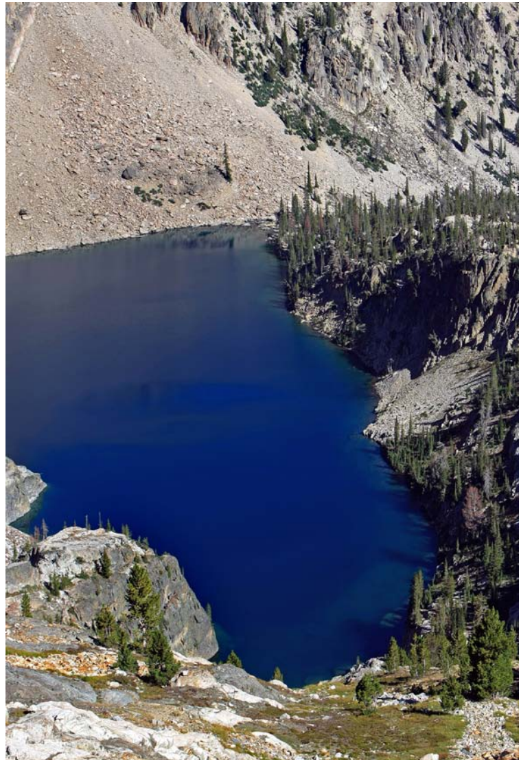
Goat Lake: Monte Stiles photo