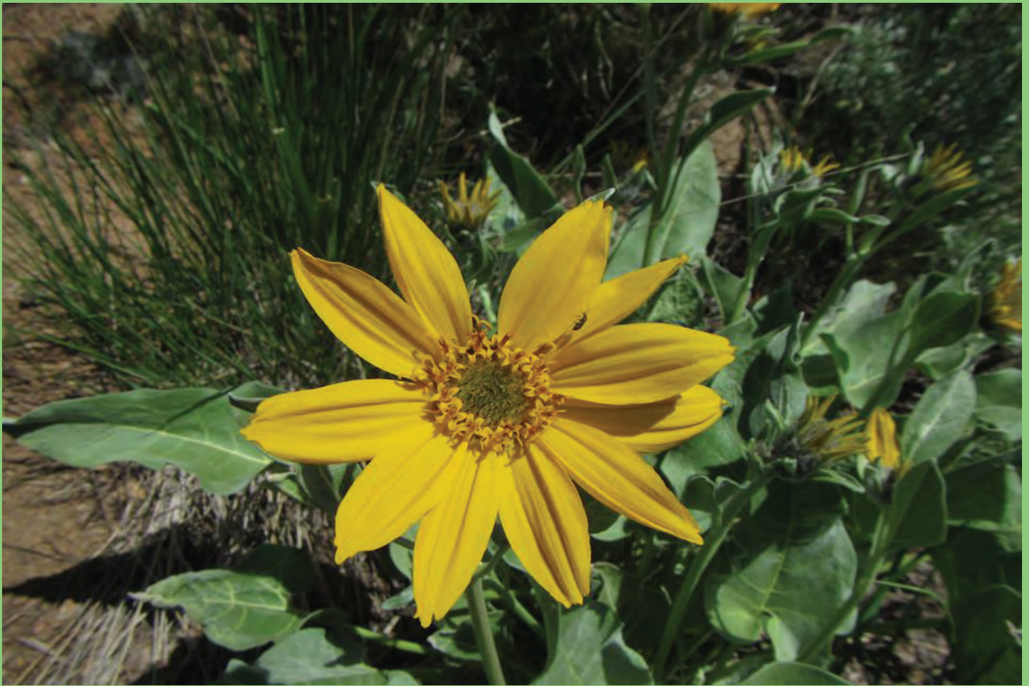
Arrowleaf balsalmroot