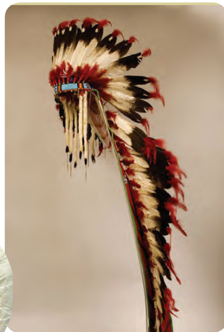
A Nez Perce Tribe head-dress and trailer holds 50 immature golden eagle feathers, coveted for their light/dark color pattern.