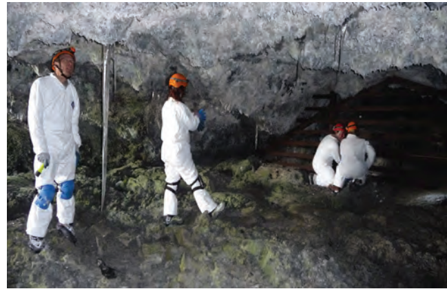
Scientists conduct mid-winter surveys of bats in a lava tube cave. Disposable suits minimize the risk of contaminating bat hibernacula with White-nose syndrome, Photo © NPS

Fortunately WNS is not yet a reality for bats at Craters of the Moon. Biologists will use this time to better understand the role of bats in the monument's ecosystem, and several caves remain open to visitors who have been screened for WNS and receive a cave permit. That way, even if you never go looking for a bat in a cave you can help provide them a safe home for years to come.