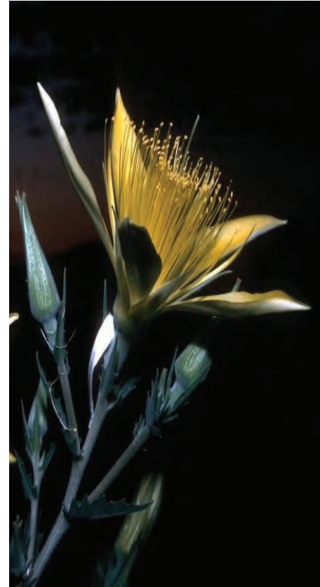
Clockwise from top left: Indian paintbrush, blazing star, arrowleaf balsamroot, and dwarf monkeyflower

Our Facebook page also provides regular reports on wildflowers and other observations in the park: https://www.facebook.com/CratersoftheMoonNationalMonument