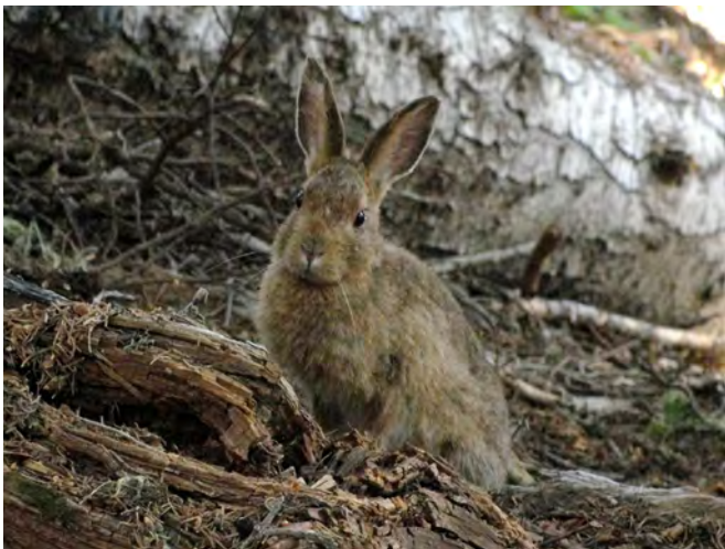
Snowshoe hare in summer