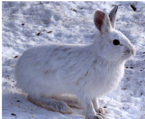
Snowshoe hare in winter white

How You Can Help Idaho's Wildlife in 2014 Page 3