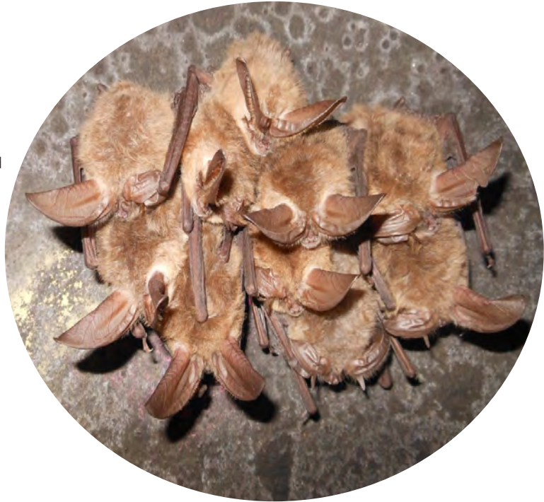
A cluster of Townsend's big-eared bats hibernating in Niter Ice Cave in southwest Idaho.

Every winter, Idaho's wildlife walks a precarious line between survival and certain death. As wildlife enthusiasts, our duties are to help improve conditions, minimize disturbance, and educate others about these fascinating critters.