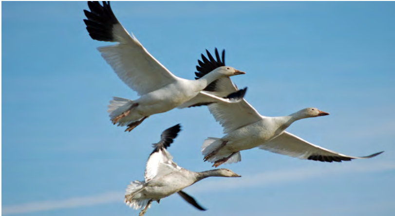
Snow geese