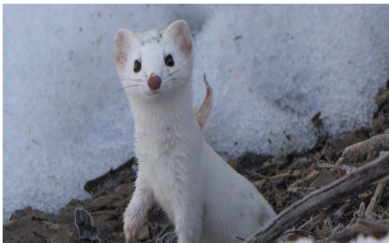
Short-tailed weasel (ermine) in winter