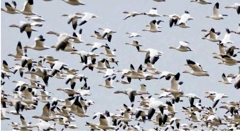
Snow geese in flight over a field