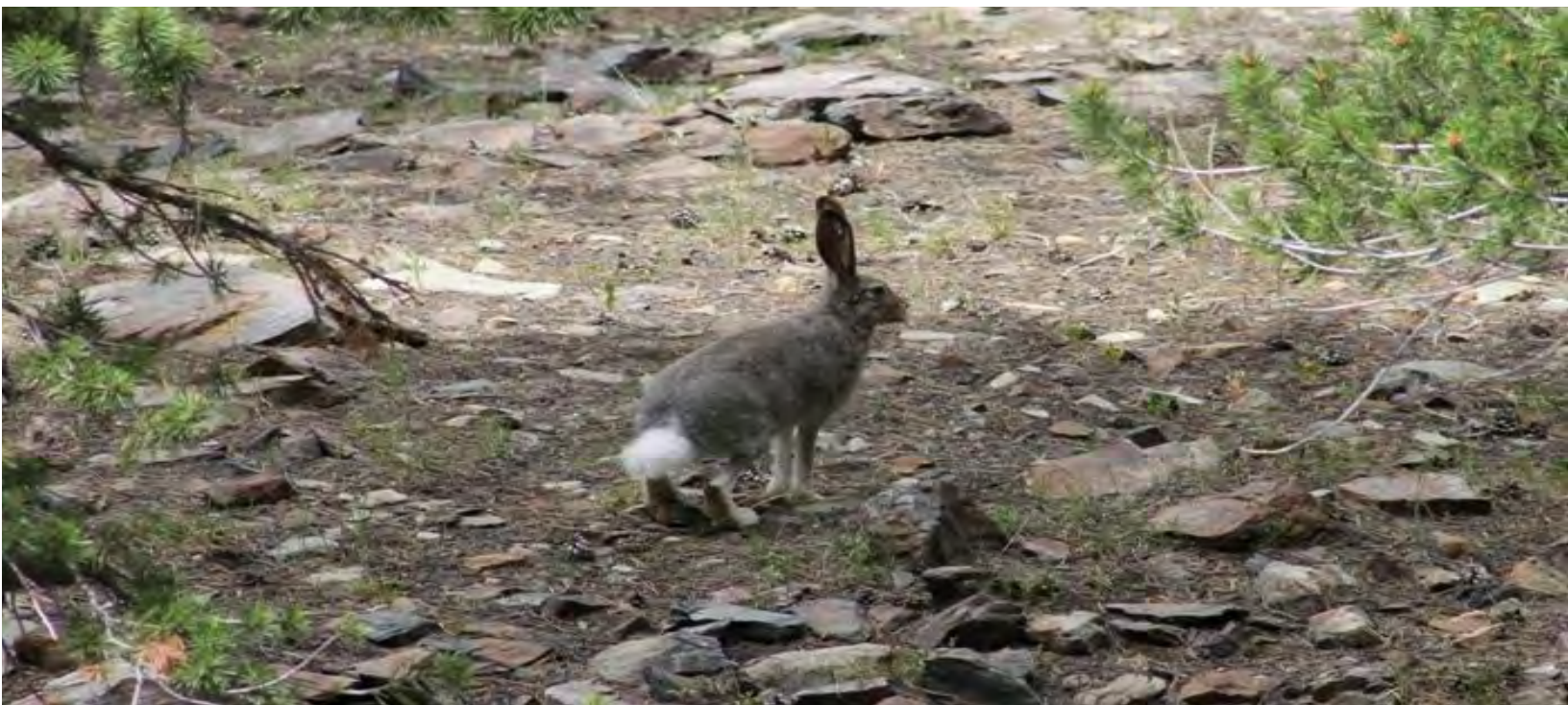
White-tailed jackrabbit in its summer coat