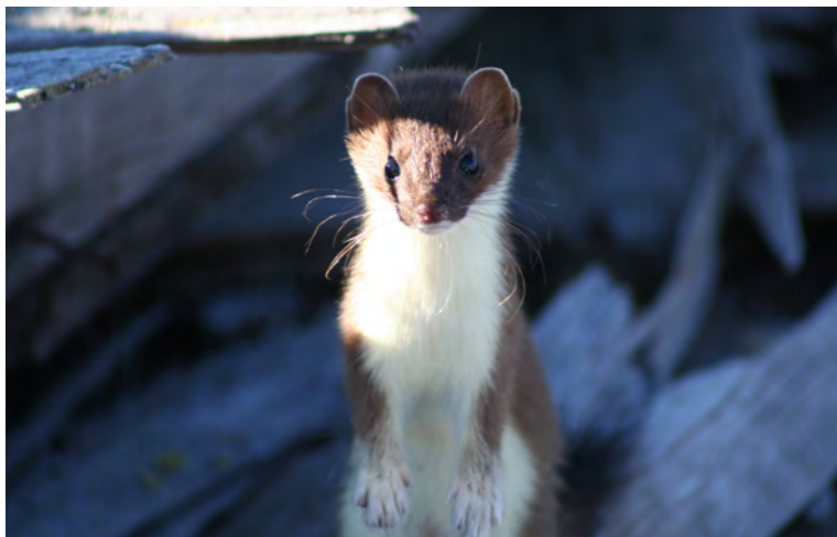
Short-tailed weasel

Seasonal camouflage is a fascinating survival strategy, but it could become a liability in a changing climate. With climate scientists predicting decreases in the duration of snowpack in the Rocky Mountains and elsewhere, animals that change color with seasons may become increasingly mismatched to their surroundings. A stark white snowshoe hare against a brown snowless background would be easy pickings for a predator. Camouflage mismatch could have profound impacts on snowshoe hare predation rates. Over time, fewer hares would feed fewer predators, creating a negative cascade through the ecosystem. In a changing climate, animals that specialize in seasonal camouflage will have to move to snowy environments, adapt, or die. Recent research led by University of Montana professor L. Scott Mills found that snowshoe hares are able to respond to seasonal mismatch by changing the rate of their spring molt to existing snow conditions. Whether this response is shaped by genetics, temperature, or other mechanisms is not yet understood, but this exciting discovery of rapid local adaptation suggests that other mammal species that change color with the seasons may be able to persist in a changing climate by adapting in place.