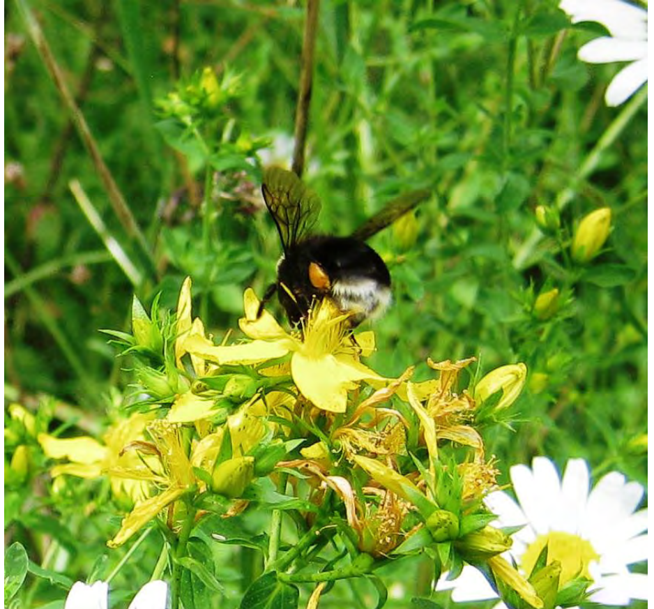
Western Bumblebees ( Bombus occidentalis ) were once common in the western US but are now hard to find.

It’s easy to provide habitat to meet bees simple needs. Bees need flowers to forage, a place to nest, and to not be exposed to pesticides. To make your yard bee friendly you would first identify and protect existing habitat. Determine which flowers you have and when they bloom. Then look for potential bee nest sites. About 70% of North American bees nest in the ground either digging their own tunnels or using abandoned rodent burrows. Most of the remaining bees nest in wood tunnels such as abandoned beetle nests in standing snags. To find bee nests look for bees flying low and slow in areas where flowers are not present.