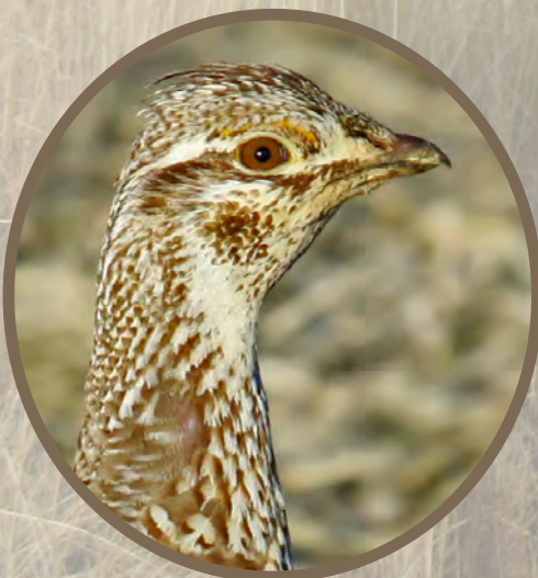
A wing barrel at Tex Creek WMA Sharp-tailed grouse and spruce grouse Ruffed grouse

Feathers are treasure troves of information for biologists. Feather wear, feather molt patterns, feather colors and patterns are all clues to the age of birds. In some species, the variation in feathering between different aged birds is striking. Birders rely on feather colors and patterns to identify the bird they are viewing. For the birds themselves, feathers are exquisite adaptations for survival in habitats around the globe and the means by which they slip into the skies above, catching our eyes and making us wish that we too, could fly.