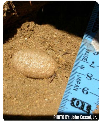
Above: Great Basin Collared Lizard egg in a burrow under a rock. Below: Hatchling Great Basin Collared Lizard.

acre have been documented in good habitat. The primary threats to this species include loss or alteration of suitable habitat by development, fire, and invasive, nonnative plants. Conversion of native shrublands to invasive grasses has probably inhibited lizard dispersal and decreased prey availability. The use of pesticides to control insects appears to have affected some populations. Past collecting for the pet trade has reduced the size of some populations. Quarrying for ornamental rocks has reduced habitat in localized areas. Hopefully by learning more about this species and taking the appropriate actions (especially habitat management), we will be able to assure its continued presence in Idaho.