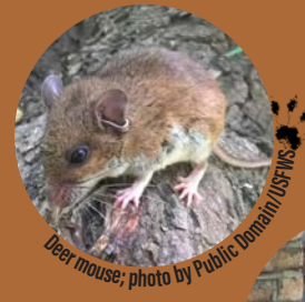
Deer mouse: photo by Public Domain/USFWS