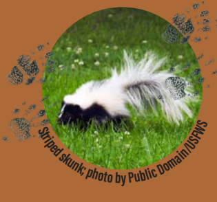
Striped skunk: photo by Public Domain/USFWS