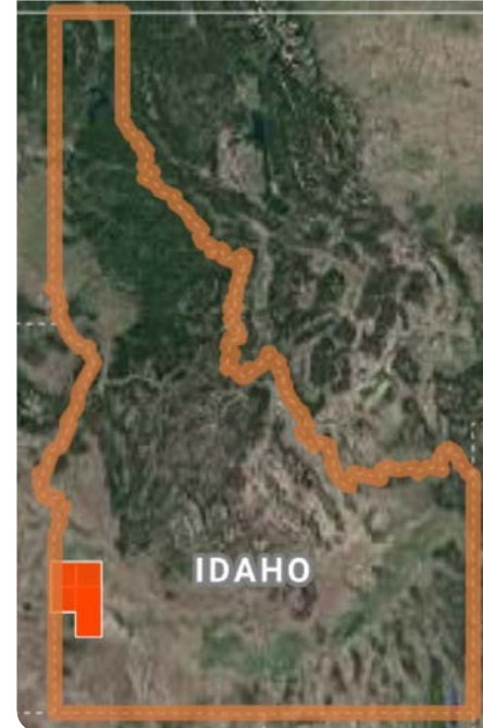
Figure 2 iNaturalist Great Basin Collared Lizard observations as of October 2020.

Great Basin Collared Lizards generally inhabit dry, rocky areas (washes, boulder-strewn hillsides, rock piles, and talus slopes) with sparse vegetation (Figure 3). Von Pope, a former Boise State University graduate student and Idaho Power biologist, found that they occurred in only four habitat categories in Idaho: salt desert shrub, big sagebrush, perennial grassland, and shrub-steppe annual grassland. He also found they were also more likely to use steeper, southwest facing slopes. John Cossel and his students found that they usually selected rocks from 10” to 39” in size for basking, perching, and protection.