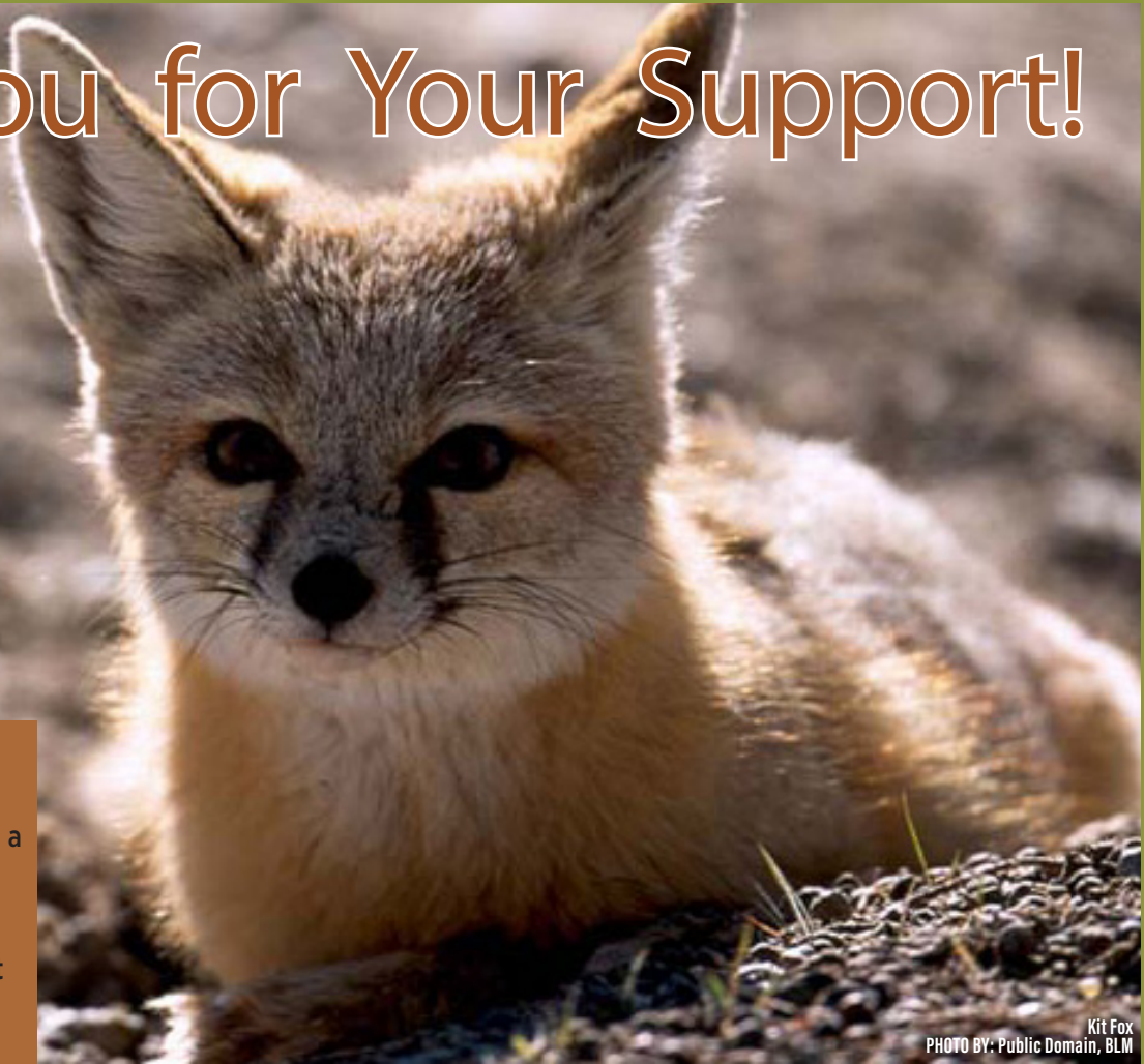
Kit Fox

Thank you to those who made direct donations, purchased or renewed a wildlife license plate, or let us know of a tax check-off donation between July 1 – September 30, 2020.