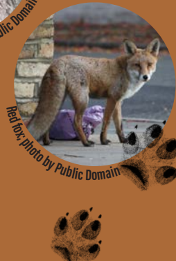
Red fox: photo by Public Domain