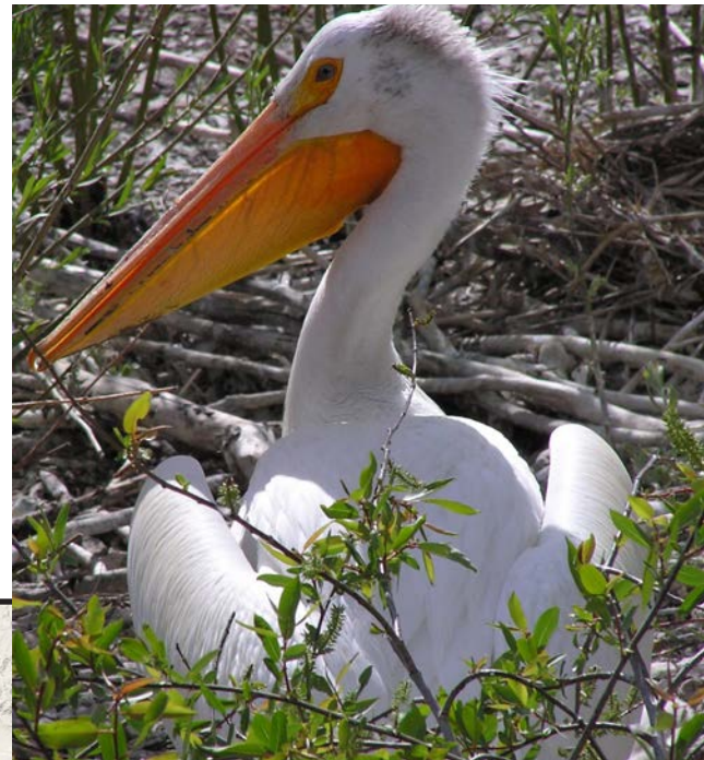
Top: IDFG staff attaching a transmitter to an adult pelican at Blackfoot Reservoir; Right: Adult pelican on Gull Island in Blackfoot Reservoir; Bottom: Flight path of one transmitter-carrying pelican from Blackfoot Reservoir to eastern Colorado.

males we caught. About half of them appeared to be nesting on Gull Island, and many of them were making regular trips of 30 miles or more to forage. Some were even commuting down to the Great Salt Lake on occasion. And one bird flew 200 miles in about 4 hours (50 miles per hour!), headed for a lake in eastern Colorado to take advantage of a good shad fishery. He would soon be joined by a couple of other transmitter-carrying pelicans who also apparently knew about the shad. Watching these birds move around the west, and south into Mexico, it has become clear that their concept of “local” is much larger than our own, and they carry with them an incredible internal map of where the safe resting waters are, and where the fish are and when.