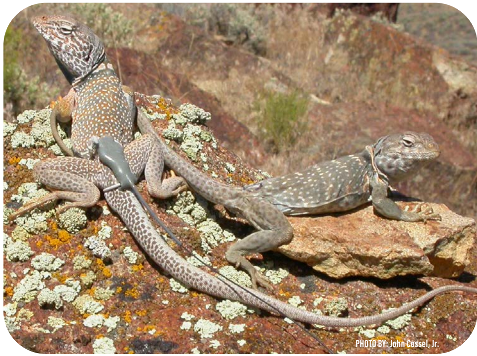
Figure 4 Female and male Great Basin Collared Lizards in Owyhee County, Idaho. The male is wearing a small radiotransmitter.

Because of their limited range in Idaho and special habitat requirements, Great Basin Collared Lizards are considered a "Species of Greatest Conservation Need." Resurveying of historical locations is needed to better determine the status and trends of this species in Idaho. Population densities of up to about two lizards per