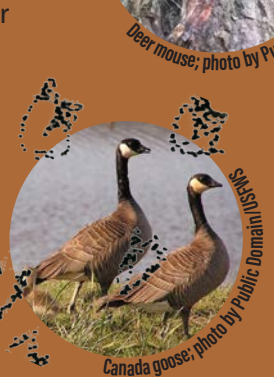
Canada goose: photo by Public Domain/USFWS