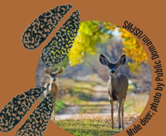
Mule deer: photo by Public Domain/USFWS