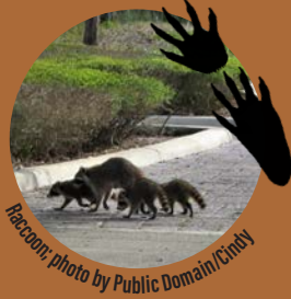
Raccoon: photo by Public Domain/Chinty