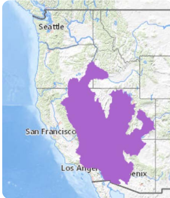
Figure 1 Great Basin Collared Lizard range map. U.S. Geological Survey - Gap Analysis Project, 2018, U.S. Geological Survey - Gap Analysis Project Species Range Maps CONUS_2001: U.S. Geological Survey data release, https://doi.org/10.5066/F7Q81B3R

As the name implies, these lizards are found within the Great Basin of western North America (Figure 1). In Idaho, they are found in the southwestern portion of the state, along the Snake River Plain and surrounding Owyhee foothills. There are reliable, historical records of their occurrence in Owyhee, Canyon, Ada, and Elmore counties. However, all documented records within the past 15 years are only from Owyhee County (Figure 2). We encourage people to use the iNaturalist mobile app or website ( www.inaturalist.org ) to report their observations of this species so we will have a better idea of their current distribution in Idaho.