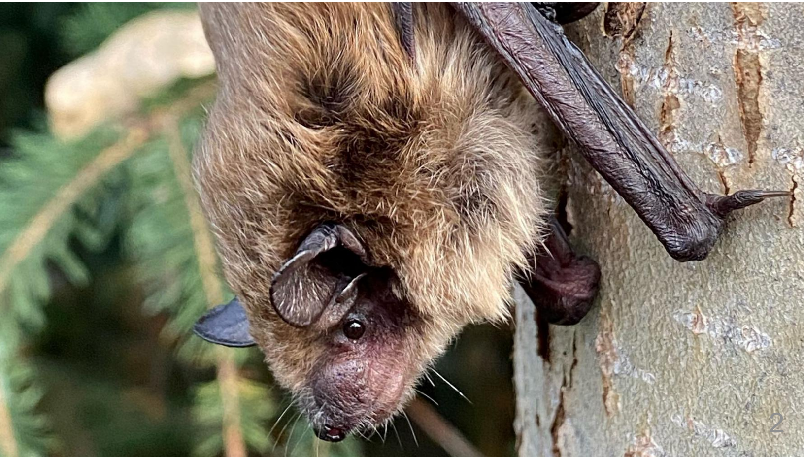
Closeup of a Big Brown Bat on a tree.

Big Brown Bat: Predator of nocturnal insects