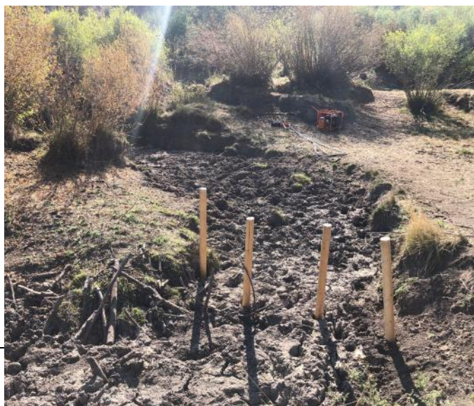
Gas and hydraulic powered post drivers are used to drive posts into the riverbed. A combination of sticks, logs, and mud are used to build and seal the dam.