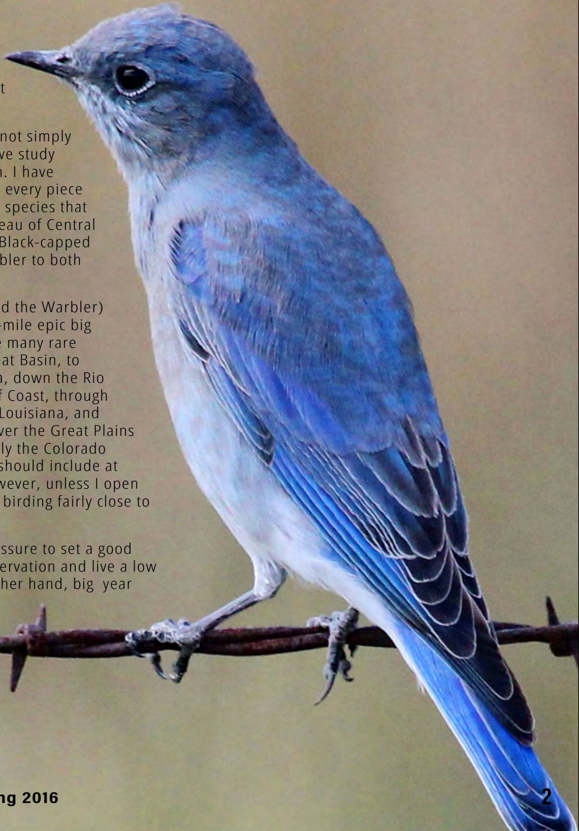
Mountain Bluebird

I am well aware of the peer pressure to set a good example of environmental conservation and live a low carbon footprint life. On the other hand, big year