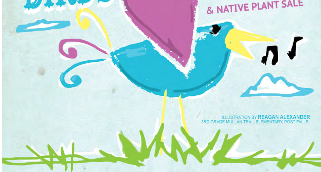
ILLUSTRATION BY REAGAN ALEXANDER 3RD GRADE MULLAN TRAIL ELEMENTARY, POST FALLS

CELEBRATING 100 YEARS OF BIRD CONSERVATION!