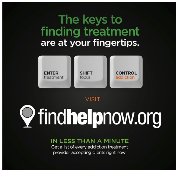
Examples of branded marketing materials created by Vimar