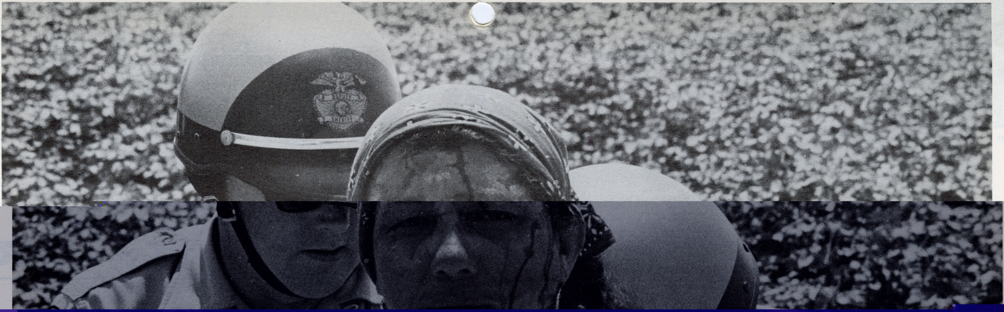
El Malcriado / Manzell