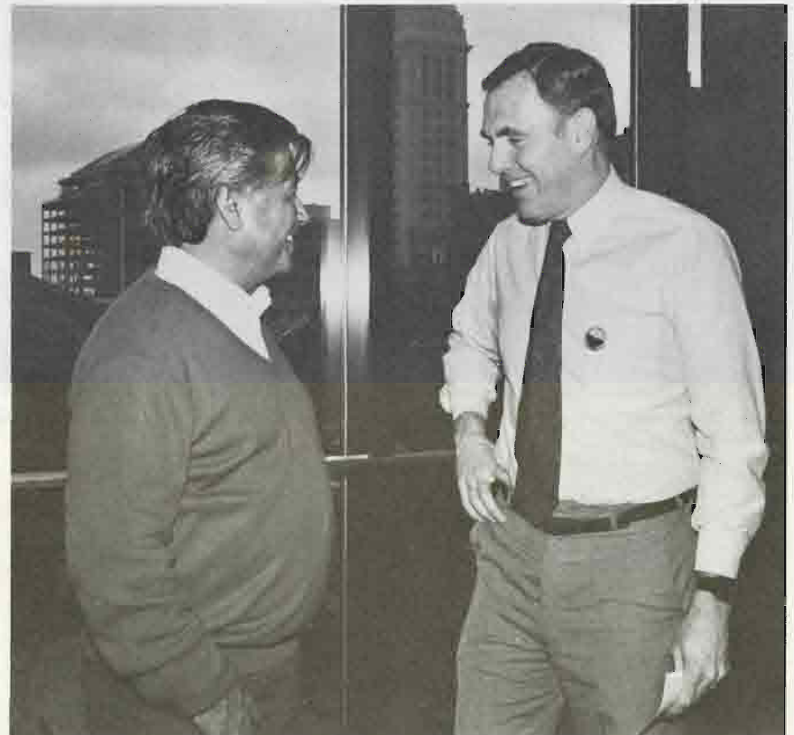
With Mayor Raymond Flynn at his Boston City Hall office.