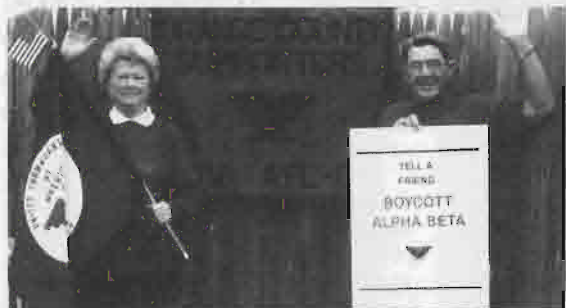
Showing the flag in Orange County.