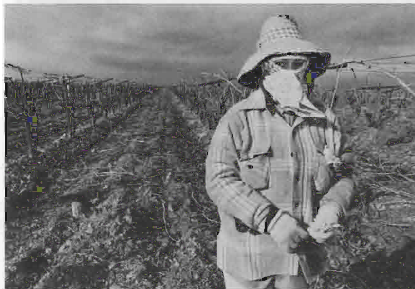
Grape workers have been especially hard hit by Gov. Deukmejian's political alliance with corporate growers.