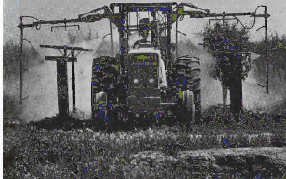
From preparation of soil until bunches are picked and shipped to stores across the country, California table grapes are saturated with dangerous pesticides.

FOOD AND JUSTICE (ISSN 0885-0704) is published monthly for $5 per year by the United Farm Workers of America, AFL-CIO, Old Highway 58, La Paz, California 93570. Application to mail at second-class postage rates is pending at Keene, California. POSTMASTER: Send address changes to FOOD AND JUSTICE, P.O. 62, La Paz, California 93570.