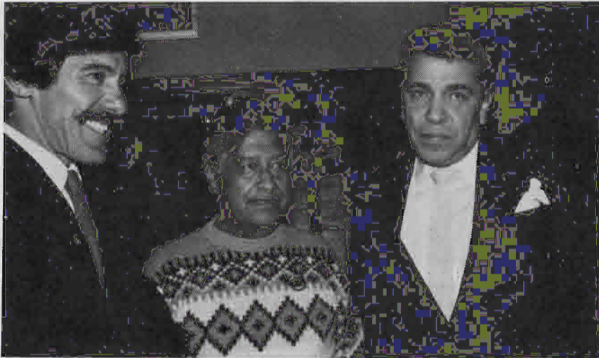
TV personality Geraldo Rivera emceed New York fundraiser to support the UFW table grape boycott. At right is State Congressman Robert Garcia.