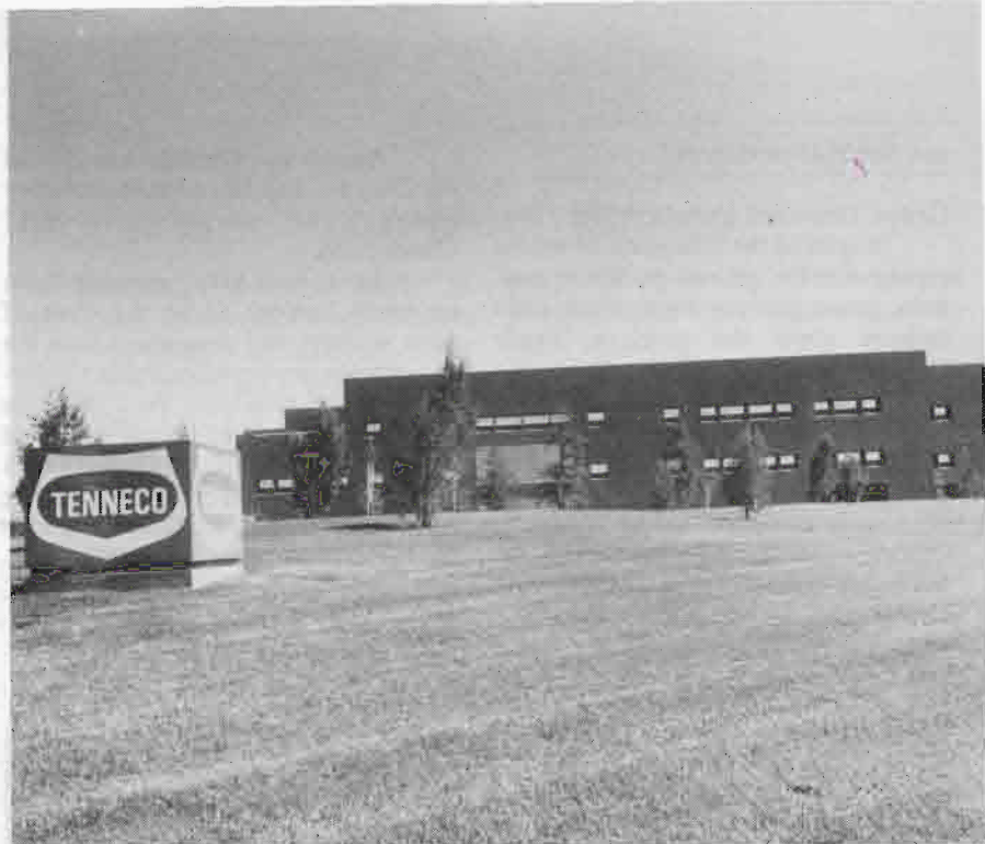
Corporate grape growers like Tenneco and Giumarra Vineyards are the worst offenders in the reckless use of dangerous pesticides.

Even though pesticides, more than any other environmental problem, pose a greater threat to the lives and