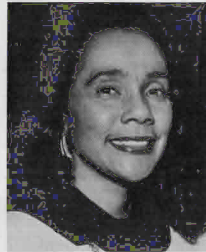
Coretta Scott King

"I am delighted with your visit and am pleased to give you our endorsement of your boycott," Huerta was told by King, president of the Martin Luther King, Jr. Center for Nonviolent Social Change.