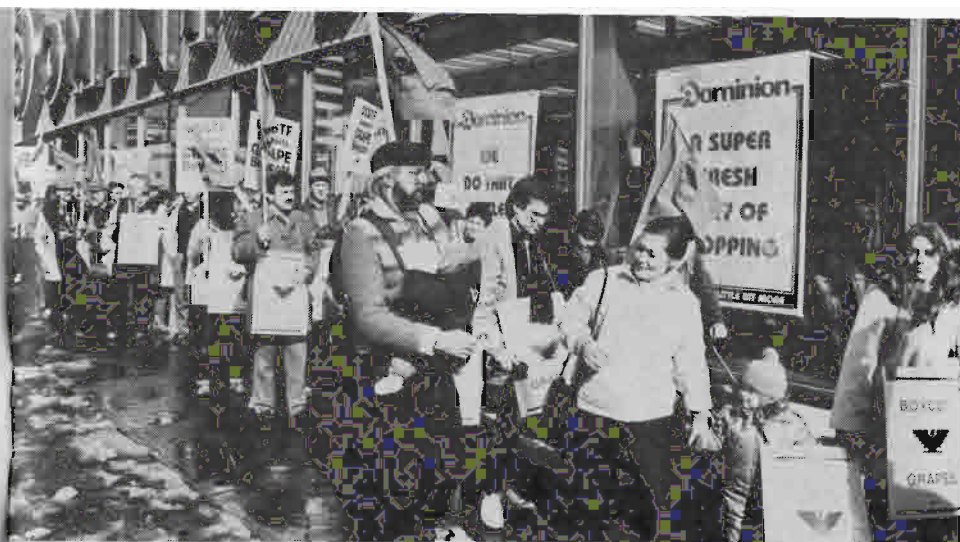
Toronto supporters help kick off a store boycott of A&P-owned New Dominion supermarkets in Canada.

The UFW is alive at 25 — and going for the gold! ♡