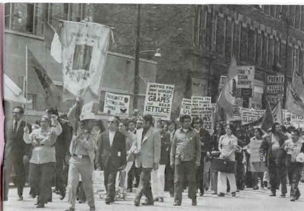
Millions of people in the U.S. and Canada turned out to support UFW grape and lettuce boycotts in the '60s and '70s.

FOOD AND JUSTICE (ISSN 0885-0704) is published monthly for $5 per year by the United Farm Workers of America, AFL-CIO, Old Highway 58, La Paz, California 93570. Second-class postage is paid at Keene, California. POSTMASTER: Send address changes to FOOD AND JUSTICE, P.O. 62, La Paz, California 93570.