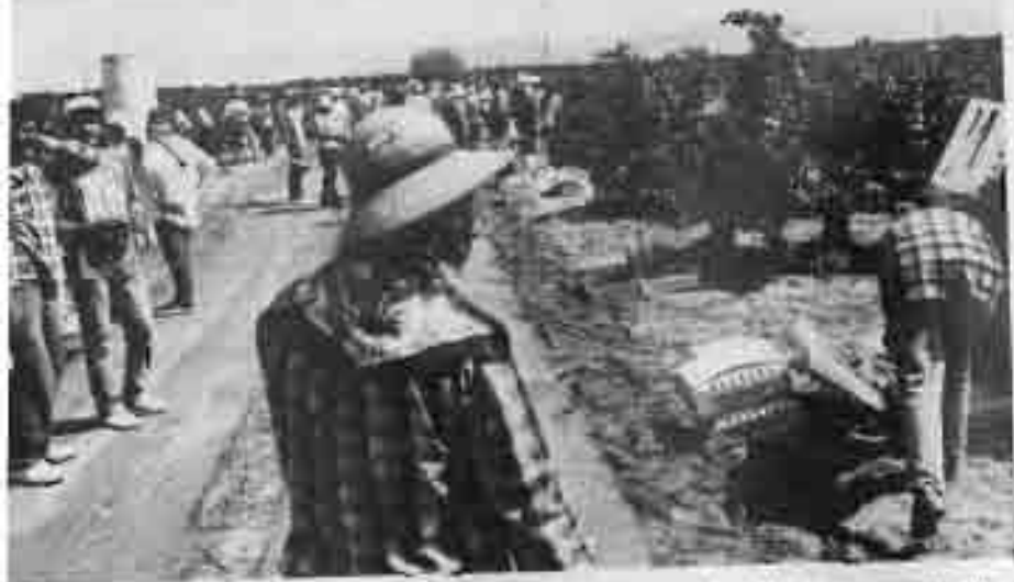
The so-called labor shortage in California is just "a sham" by growers to get a warmed-over, cheap-labor Bracero Program from the government.

the reasons, perhaps the major one, was the current UFW boycott. At a march and rally on June 21, before the full extent of the disastrous grape season was evident, he told 500 farm workers: