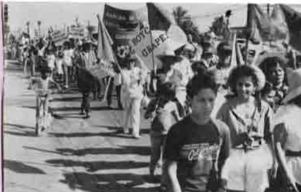
Down in the Coachella Valley things are looking up as workers keep marching and grape growers begin to feel the effects of the boycott.