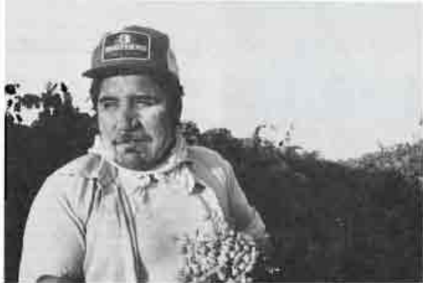
Farm workers are poisoned by pesticides in the fields and consumers by residues that remain on common foods.

tics — mainly growers and manufacturers who say the risks are "overstated" and not based on "reality." But the researchers say the report, while "conservative," could easily underestimate the risks for several reasons: the researchers lacked toxicological data for many active ingredients, inerts, breakdown products and metabolites (which result from cooking); the report omitted the possibility that consumers are exposed to pesticides by air, water and soil contamination; and the report omitted the risk when two or more residues on food interact.