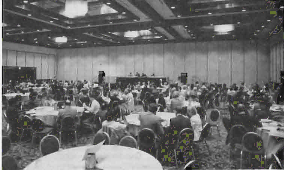
The National Council of Churches endorses — and calls on its congregations with 40 million members — to endorse the grape boycott.