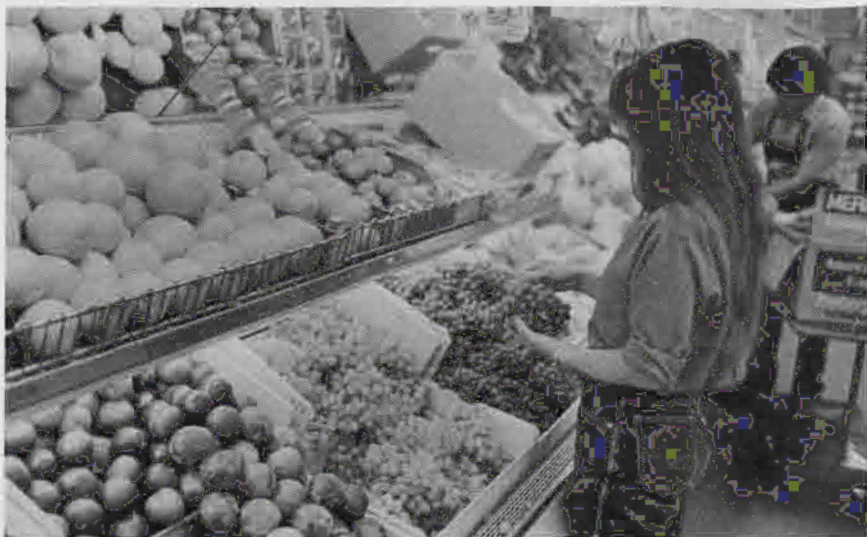
In spite of the EPA Tag-the-Bunch game, all California table grapes contain sulfur dioxide pesticide residues.

Predictably, the EPA had no sooner issued its order before grape growers were demanding that the EPA waive its rule.