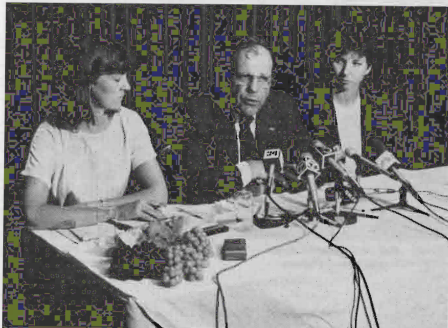
Table grape spokesman Obbink: Grape growers need "two or three years to find alternatives to treating table grapes with sulfur dioxide."

And the EPA, instead of just saying no to growers for a change, keeps playing games — as usual.