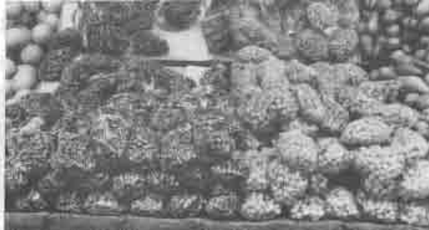
"If you're a Sherlock Holmes, you might find one at the bottom of the display bin."