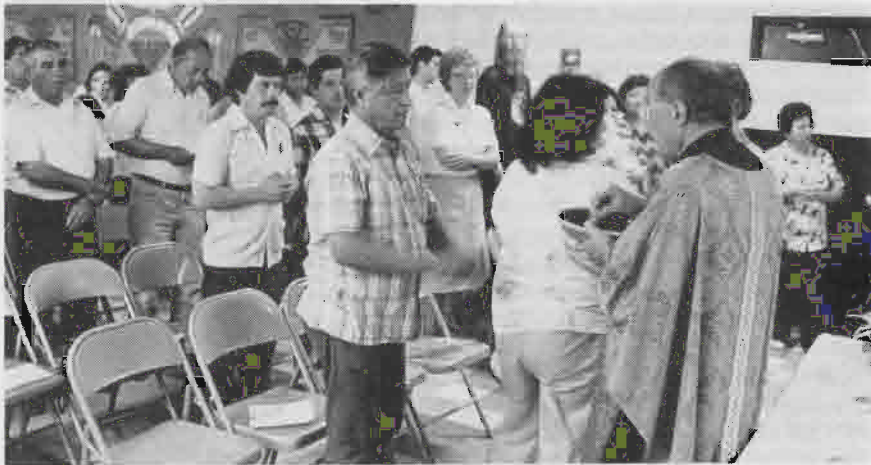
Helen and Cesar Chavez receive Communion at the first Mass of the fast.

"The solution to this deadly crisis will not be found in the arrogance of the powerful but in solidarity with the weak and the helpless. I pray to God that this fast will be a preparation for a multitude of simple deeds for justice, carried out by men and women whose hearts are focused on the suffering of the poor and who yearn, with us, for a better world. Together, all things are possible."