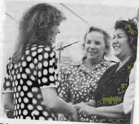
Ethel Kennedy introduces her daughter Kerry to Helen Chavez before Mass begins.