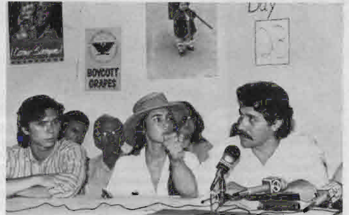
Declaring his support for the grape boycott as the best means to restore farm worker rights and fight the pesticide menace is Eddie Olmos of "Miami Vice" and star of "Stand and Deliver." At his right are actors Julie Carmen and Lou Diamond Phillips.