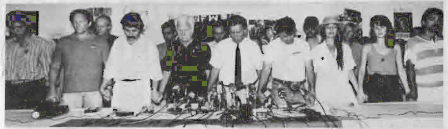
On August 8, a large contingent of celebrities visited Chavez on the 23rd day of his Fast for Life and then held a press conference. Several stars issued individual statements before answering questions from the media. Above, actor Martin Sheen invites the celebrities to stand and pray with him for an end to the pesticide poisoning that endangers farm workers and consumers. From left to right are Lou Diamond Phillips, Charles Haid, Mike Farrell (back row), Eddie Olmos, Eddie Albert, Ruben Blades (back row), Sheen, Robert Blake, Julie Carmen, Daphne Zuniga, and Carlos Palomino. Not shown are Emilio Estevez, Max Gail, Rose Portillo, and several other stars seated near the table.