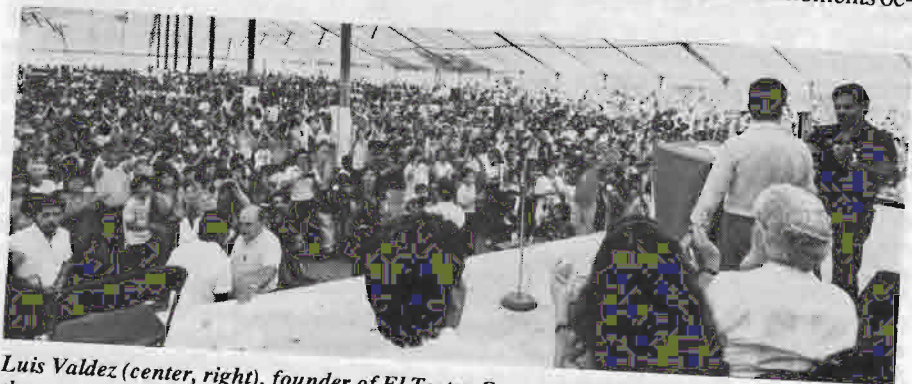
Luis Valdez (center, right), founder of El Teatro Campesino and Master of Ceremonies for the program that followed the Mass, introduces Cesar Costa, Mexican singer and movie star.