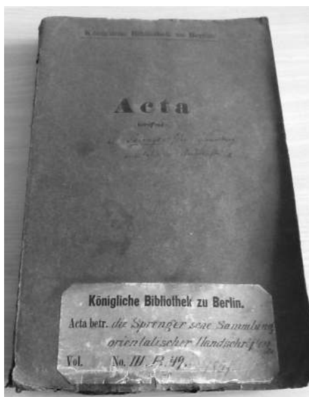
Figure 2-1. Cover of the Sprenger Collection files of Oriental manuscripts: “Sprenger, Seine Sammlung,” Acta III B 49, 1857.

hundred aesthetic, grammatical, logical, medical, geographical, historical, astronomical, and encyclopedic volumes in Arabic, Persian, Urdu, and Chaghatai Turkish. As Hars Kurio aptly notes in his brief but insightful analysis of the Arabic Manuscripts of the Bibliotheca Orientalis Sprengeriana : “The emergence of the ‘Bibliotheca Orientalis Sprengeriana’ is embedded in a specific historical situation in Europe; both intellectual history—the rise of Oriental studies, romanticism—as well as political and economic factors are relevant here. The creation of this collection is incomprehensible without the intellectual-historical and political developments, in which it is woven.” 87 Kurio does not provide information on the political conditions in which Sprenger “acquired” his collection. Were all these volumes acquired through legal and legitimate means? Or was Sprenger a book thief? One cannot say for sure, even when Sprenger takes for granted his borrowing privileges in the libraries that he visited. His acquisition process does not seem to disturb his employers in India or, for that matter, the purchasers of his collection in Berlin. However, the story of the acquisition of the Bibliotheca Orientalis Sprengeriana by the Reichsbibliothek in Berlin was itself not free of controversy. As documented in the files “Sprenger, Seine Sammlung” (Sprenger Collection files; figure 2-1) housed today at the Staatsbibliothek zu Berlin, the long-drawn process of acquisition